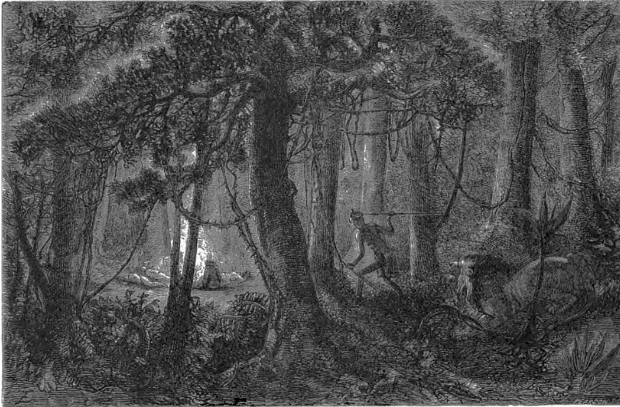
The Savage outwitted by a Lion.—Page 101.

With a movement as slow and cautious as that of the Kaffir, Hans gathered himself together for a spring on his enemy, who stood listening to the sleepers' long-drawn breaths, then with a sudden bound he dashed forward, and stabbed with his long knife at where he believed he would reach the Kaffir. He had however either miscalculated his distance, or his enemy was too quick for him, for nothing resisted his stabs, and he fell headlong to the ground, having stumbled over the underwood before him. In an instant he was on his feet again, and crouched down to catch sight if possible of his foe, but nothing was to be seen, and had it not been for a slight rustling of the leaves and the crushing of a few sticks, he would have doubted whether his eyes had not been deceived. These sounds, however, would have convinced him, had he been in doubt, that no vision had crossed his sight, but a substantial and quick-witted enemy; and thus when Victor and Bernhard, awakened by the noise made by Hans' fall, inquired what was the matter, he was able to whisper in reply, "A single Matabili has tried to becroup us as we slept."