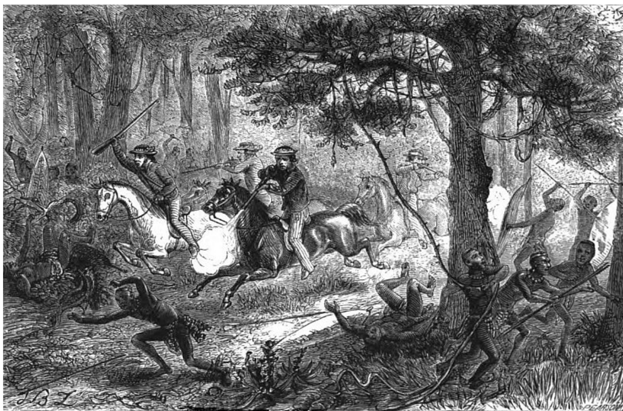
The Hunters attacked by the Matabili.—Page 29.

The hunters increased their speed, and rode on towards their dead elephants, but saw, as they approached, no Kaffirs; and all except Hans began to doubt whether the figure he had seen really was a Kaffir, or only a stump burned and blackened so as to resemble a man. The party left the open country, and rode into the forest, being obliged to ride in file along the paths made by the elephants. They had penetrated about two hundred yards into the forest, when a shrill whistle was uttered from the wood behind, and instantly from all parts of the bush an armed Matabili warrior sprang to his feet. Two hundred men at least appeared, forming a ring, in the midst of which were the hunters. These warriors did not leave the white men long in doubt as to their intentions; but beating their shields, and waving their assagies, they rushed in towards their supposed victims.