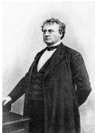
JOHN A. ANDREW

When James Freeman Clarke's exchanging pulpits with Theodore Parker alienated from him a part of his congregation, Governor Andrew strongly opposed the views of the seceders, and at a meeting called in connection with the movement made so eloquent a plea against the separation as to move his hearers to tears.