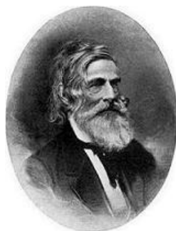
SAMUEL GRIDLEY HOWE

The little document which I drew up in the heat of my enthusiasm implored women, all the world over, to awake to the knowledge of the sacred right vested in them as mothers to protect the human life which costs them so many pangs. I did not doubt but that my appeal would find a ready response in the hearts of great numbers of women throughout the limits of civilization. I invited these imagined helpers to assist me in calling and holding a congress of women in London, and at once began a wide task of correspondence for the realization of this plan. My first act was to have my appeal translated into various languages, to wit: French, Spanish, Italian, German, and Swedish, and to distribute copies of it as widely as possible. I devoted the next two years almost entirely to correspondence with leading women in various countries. I also held two important meetings in New York, at which the cause of peace and the ability of women to promote it were earnestly presented. At the first of these, which took place in the late autumn of 1870, Mr. Bryant gave me his venerable presence and valuable words. At the second, in the spring following, David Dudley Field, an eminent member of the New York bar, and a lifelong advocate of international arbitration, made a very eloquent and convincing address.