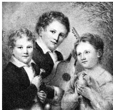
JULIA WARD AND HER BROTHERS, SAMUEL AND HENRY From a miniature by Anne Hall.

A journey up the Hudson River was undertaken, when I was very young, for the bettering of my mother's health. An older sister of hers went with us, as well as a favorite waiting-woman, and a young physician whose care had saved my father's life a year or more before my own birth. After reaching Albany, we traveled in my father's carriage; the grown persons occupying the seats, and I sitting in my little chair at their feet. A book of short tales and poems was often resorted to for my amusement, and I still remember how the young doctor read to me, "Pity the sorrows of a poor old man," and how my tears came, and could not be hidden.