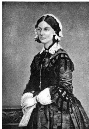
FLORENCE NIGHTINGALE From a photograph.