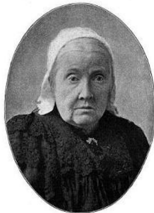
Julia Ward Howe.