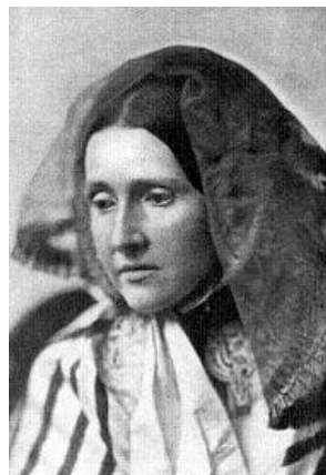
JULIA WARD HOWE

Although Dr. Howe had won his spurs many years before this time, in the guerrilla contests of the Greek struggle for national life, his understanding of military operations continued to be remarkable. Throughout the course of the war, I never remember him to have been deceived by an illusory report of victory. He would carefully consider the plan of the battle, and when he would say, "This looks to me like a defeat," the later reports were sure to justify his surmises.