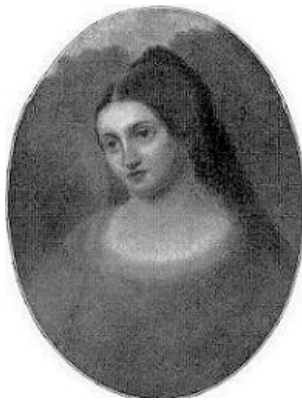
JULIA WARD HOWE