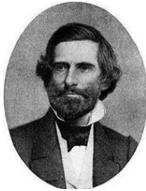
SAMUEL GRIDLEY HOWE From a photograph about 1859.

The sudden failure of Parker's health at this time was thought to render a change of climate imperative, and in the month of February a voyage to Cuba was prescribed for him. In this, Dr. Howe willingly consented to accompany him, deciding also that I must be of the party.