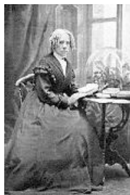
MARIA MITCHELL From a photograph.

The governing board was further composed of a vice president and director from each of the States represented by membership in the association. The name had been decided upon from the start. It was the Association for the Advancement of Women, and its motto was: "Truth, Justice, and Honor."