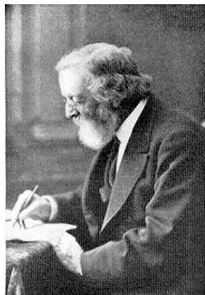
JAMES FREEMAN CLARKE

From a photograph by the Notman Photographic Company.