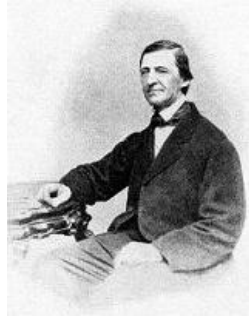
RALPH WALDO EMERSON

should say that his intellectual pasture ground had been largely within the domain of belles-lettres proper.