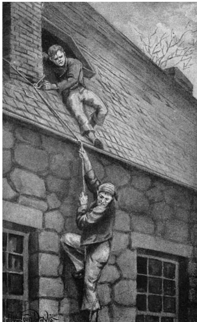
As soon as the line was made fast a man slipped down quickly followed by another. P. 335.

My comrades were ready for the work on hand immediately I gave the alarm, and swiftly the three of us crossed over, I wondering if it would be possible for us to throw the rope to the roof where the sailors could catch it.