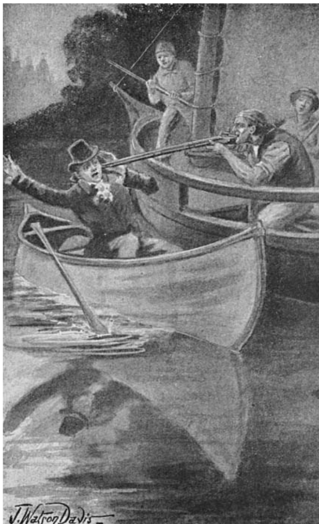
"Pass up your painter, or I'll shoot!" Cried Darius. Page 56.

"Not a bit of it," the old sailor said quietly as he set about lashing the fellow's arms and legs. "He ain't the kind that can be killed so easily. Get off the hatch, for we must have him out of sight before coming up to the mill."