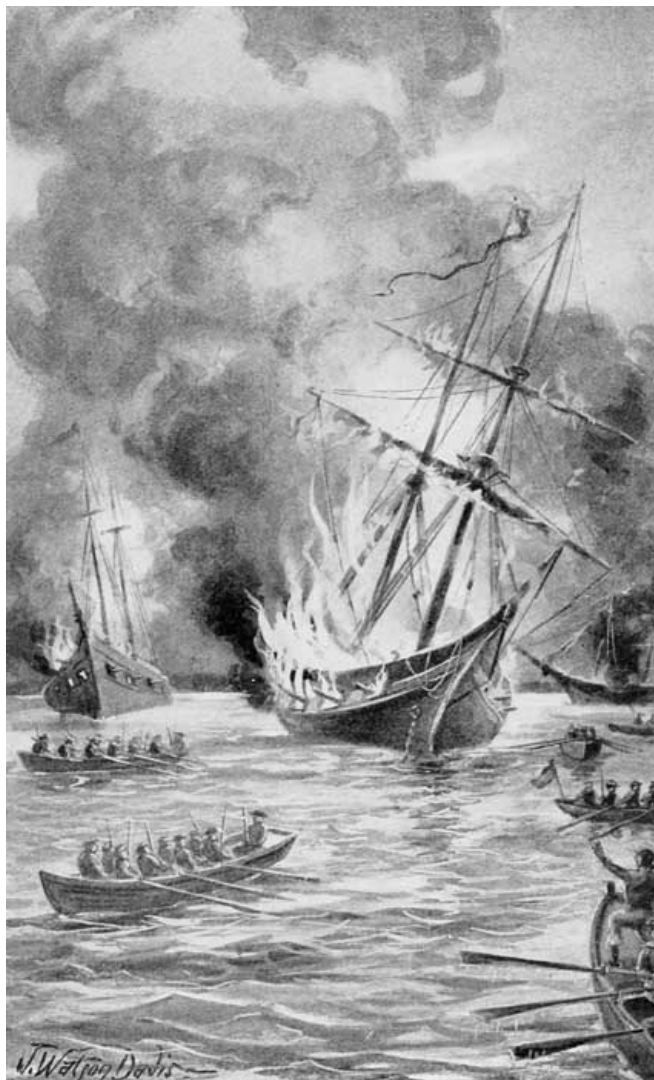
As we pulled away I glanced back at our fleet and saw that the vessels were well on fire. P. 233.

Even as Darius spoke I saw a curl of flame from the forward hatch, and then a long, glowing tongue leaped up toward the cordage. [Pg 233]