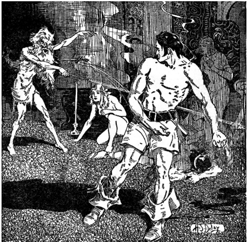
"Even as he shifted, he hurled the knife."

The cry died in the guard's throat as the thin, weird piping penetrated the metal door and smote on his ears. Xatmec leaned frozen against the door, as if paralyzed in that position. His face was that of a wooden image, his expression one of horrified listening. The other guard, farther removed from the source of the sound, yet sensed the horror of what was taking place, the grisly threat that lay in that demoniac fifeing. He felt the