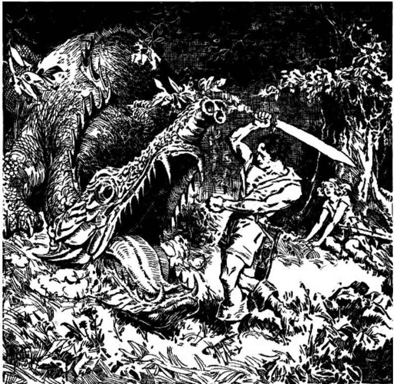
"Convinced that his death was upon him, the Cimmerian acted according to his instinct."

She was standing on a broad shelf which was about even with the tree-tops, and from it rose a spire-like jut that was the ultimate peak of the crag she had climbed. But something else caught her attention at the moment. Her foot had struck something in the litter of blown dead leaves which carpeted the shelf. She kicked them aside and looked down on the skeleton of a man. She ran an experienced eye over the bleached frame, but saw no broken bones nor any sign of violence. The man must have died a natural death; though why he should have climbed a tall crag to die she could not imagine.