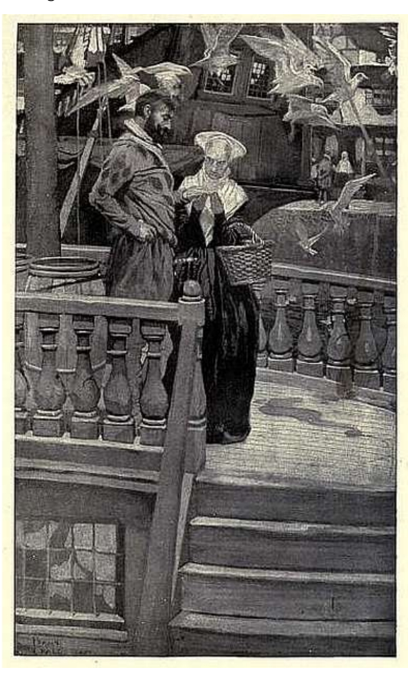
'You'll open a road from the East unto the West, and back again.'--p. 292.

"To be sure," she says. "'Tis just a apple," and she went ashore with her hand to her head. It always hurted her to show her gifts.