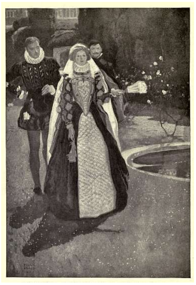
'Admiral Boy--Vice Admiral Babe,' says Gloriana, 'I cry your pardon.'--p. 41

'And which had she really looked at?' Dan asked.