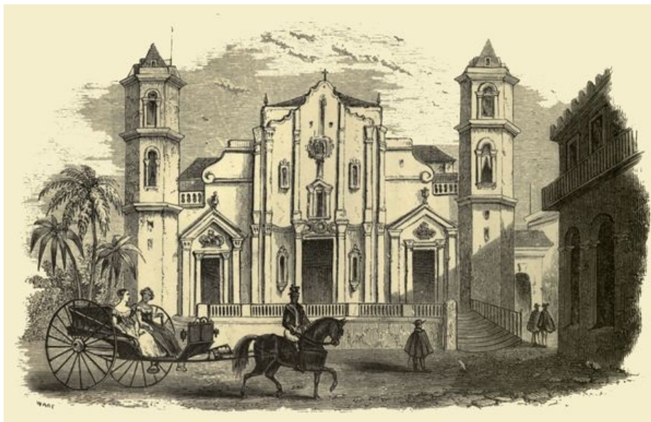
THE CATHEDRAL AT HAVANA.

The story of the great Genoese possesses a more thrilling interest than any narrative which the imagination of poet or romancer has ever conceived. The tales of the Arabian Nights, with all their wealth of fancy, are insipid and insignificant compared with the authentic narrative of the adventures of the Italian mariner and his sublime discovery. Familiar as we are with it from childhood, from the greatness of the empire he gave to Christendom, the tale has still a fascination, however often repeated, while the visible memorials of his greatness and his trials revive all our veneration for his intellect and all our interest in the story of his career. His name flashes a bright ray over the mental darkness of the period in which he lived, for men generally were then but just awakening from the dark sleep of the middle ages. The discovery of printing heralded the new birth of the republic of letters, and maritime enterprise received a vigorous impulse. The shores of the Mediterranean, thoroughly explored and developed, had endowed the Italian states with extraordinary wealth, and built up a very respectable mercantile marine, considering the period. The Portuguese mariners were venturing farther and farther from the peninsula ports, and traded with different stations on the coast of Africa.