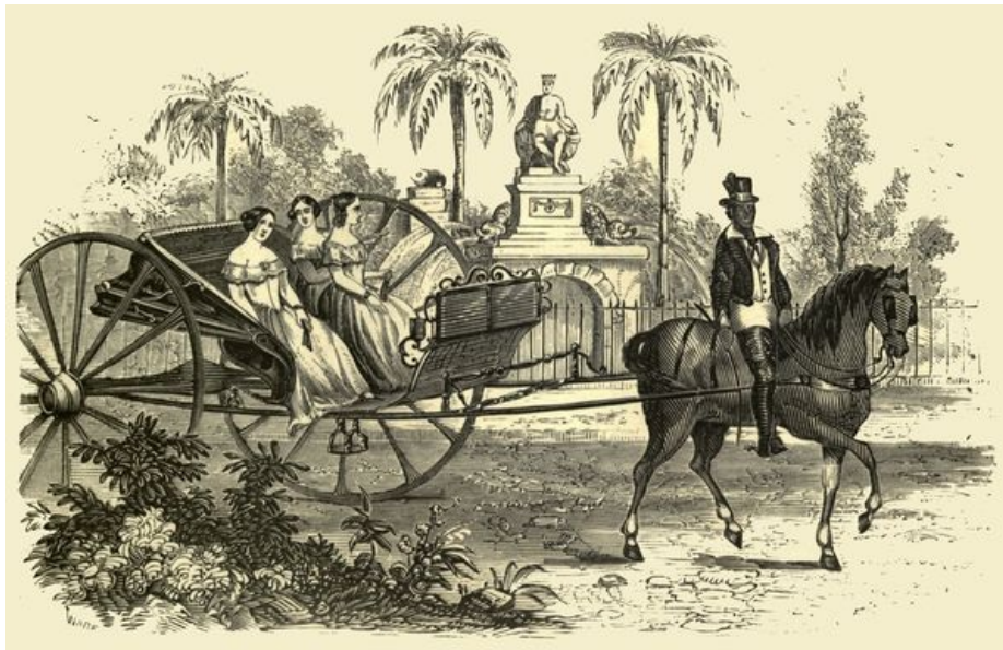
A CUBAN VOLANTE IN THE PASEO.