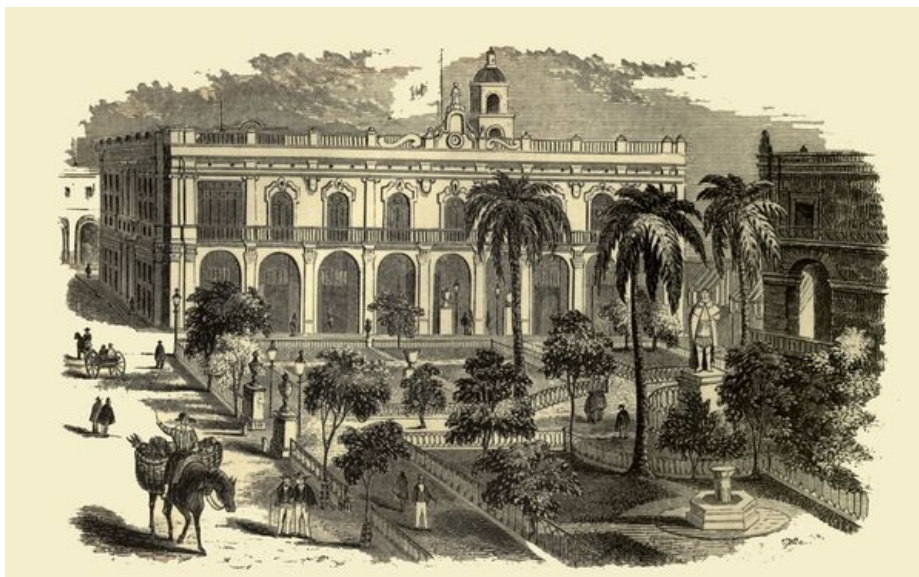
PLAZA DE ARMAS AND GOVERNOR'S PALACE.

The Plaza de Armas of Havana is a living evidence of this, and is the nightly resort of all who can find time to be there, while the governor's military band performs always from seven to nine o'clock. The Creoles call it "the poor man's opera," it being free to all; every class resorts hither; and even the ladies, leaving their volantes, sometimes walk with husband or brother within the