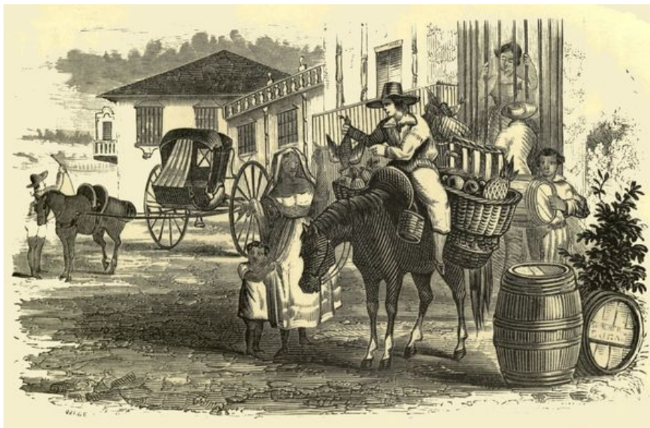
CHARACTERISTIC STREET SCENE.