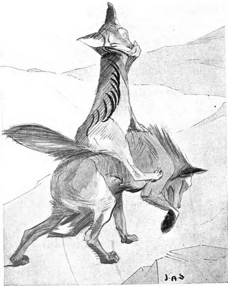
“DEN HE GO ON AGEN.”

“Dis de funniest ever you foun’, For de sick he carry de soun’— Work’s on’y a fool to a trick, For de soun’ he ride de sick.