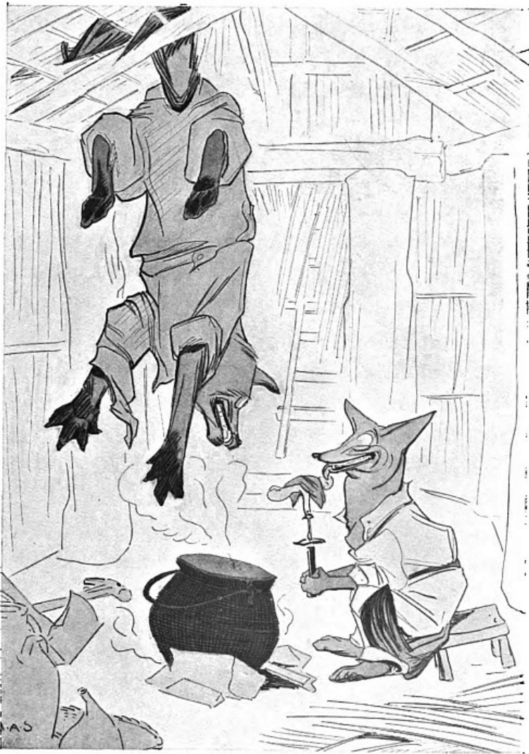
"YOU OUGHT TO SEEN HIM LICK HIS LIPS."

"He swip his head round, an' dere was Ou' Jackalse wid de lid up an' his nose a-workin' an' a-sniffin' in de steam. Didn' Ou' Wolf shout den. 'Ho, yeh! How com' yeh at darie dinner again?'