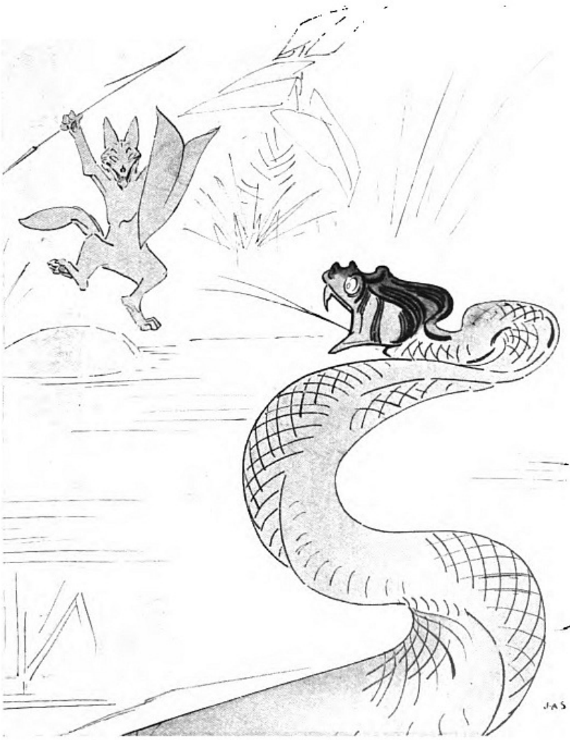
"WHEN HE SEE OU' JACKALSE DOIN' DARIE WAR-DANCE."

went so fast it yust swish right across to de yonder side de drift, an' Ou' Jackalse he step out an' snatch up a willow stick in one hand, an' a big leaf in de oder, like a assegai an' a shield, an' swip! he begin to do a war-dance, yust a-leapin' high an' a-chantin.