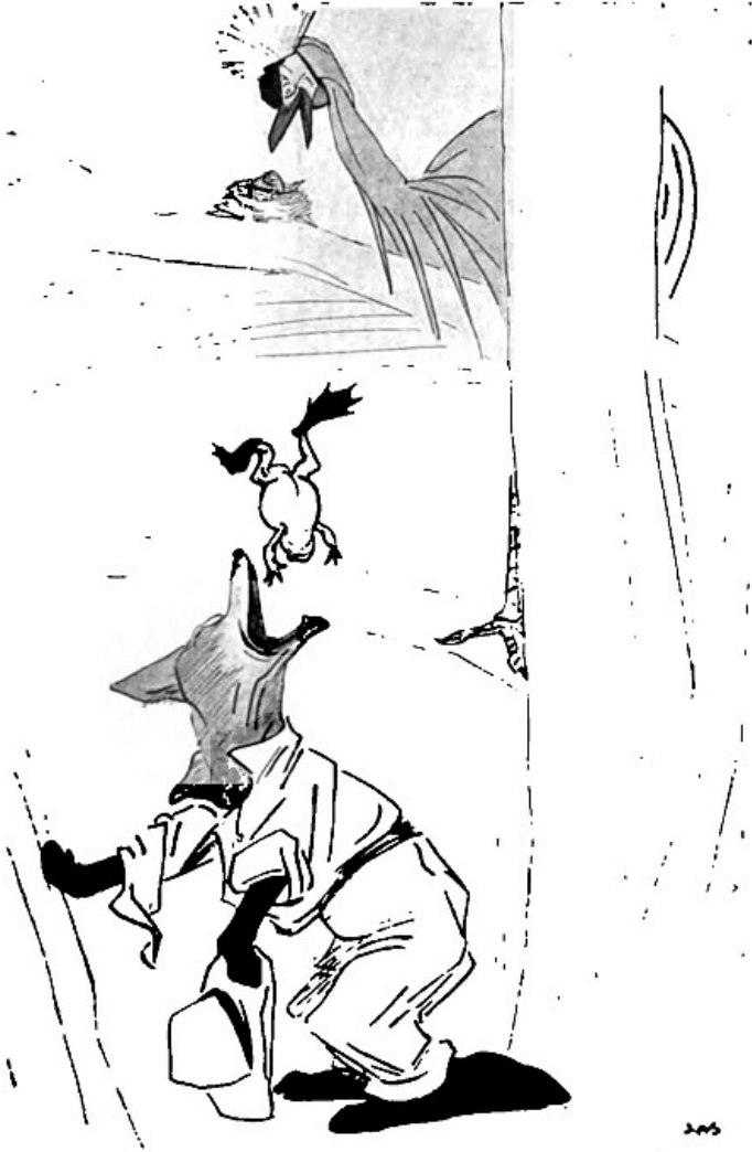
"SHE DROP A GREAT BIG BULL-FROG RIGHT INTO OU' JACKALSE'S FROAT."

"Little missis she go back, an' in a minute or two Ou' Reyer follows, an' she hide herse'f in de top o' de willow-tree over de nest. 'Now for Ou' Jackalse,' ses she.