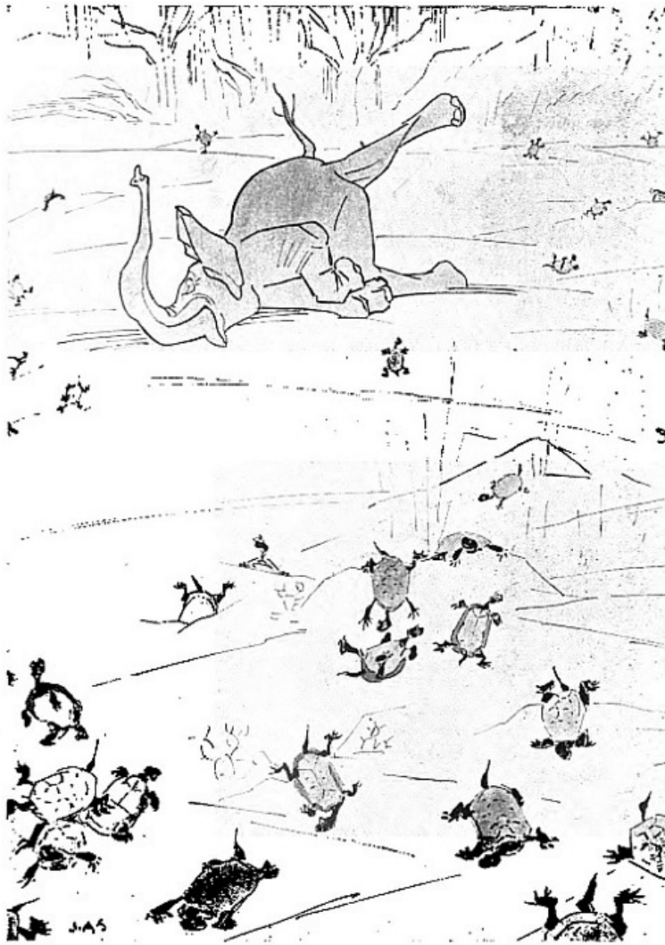
“‘RUN NOW!’ SHOUTS DE SCULPATS.”

“‘Run now!’ shouts de sculpats. ‘Darie elephant’s Klein Hahsie’s daddy, an’ he’s a-gun’ to get up an’ tromp us to smash! Get away now!’ ses dey.