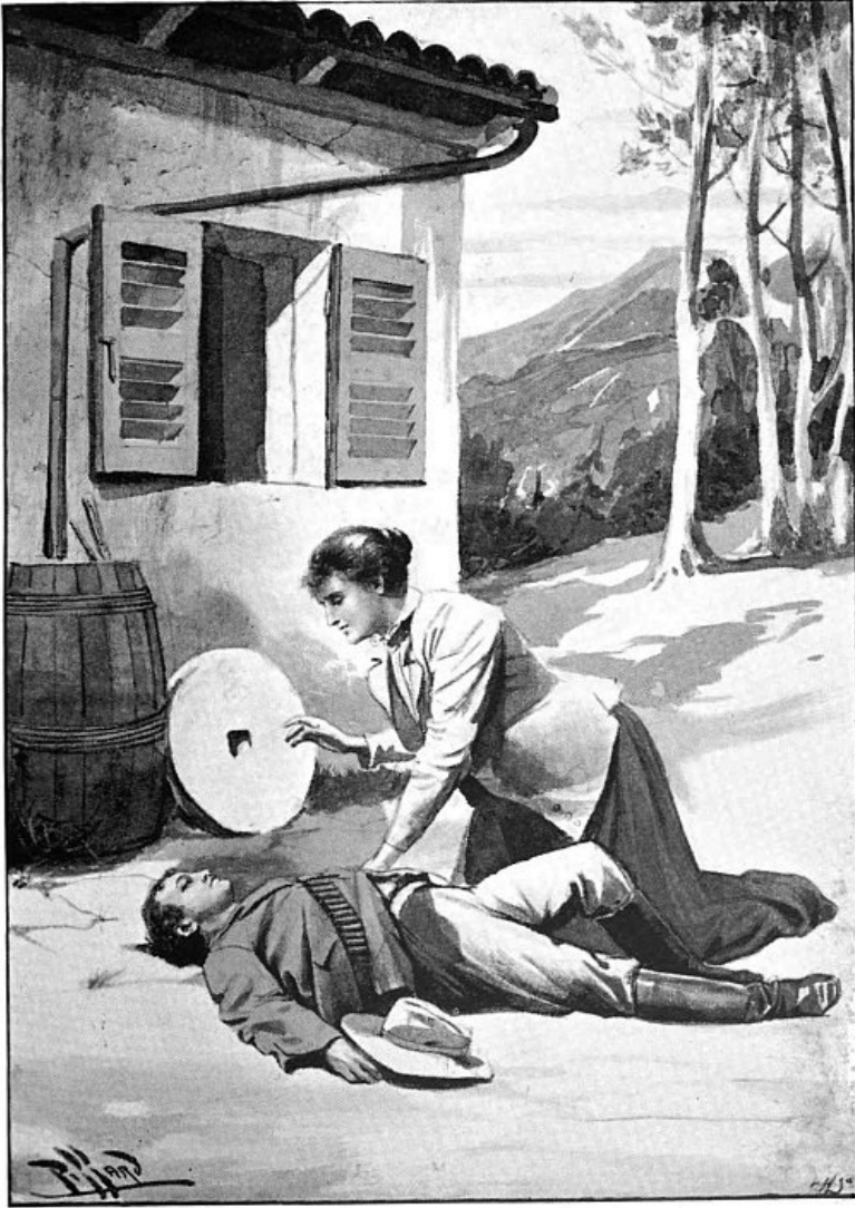
“JIMMIE!” SHE CRIED, “WHAT HAS HAPPENED?” Page 126.

A form was lying on the ground covered with blood and dust. Nidia recognised it in a moment for that of Hollingworth's eldest boy—the youthful hunter whose prowess she had been about to congratulate.