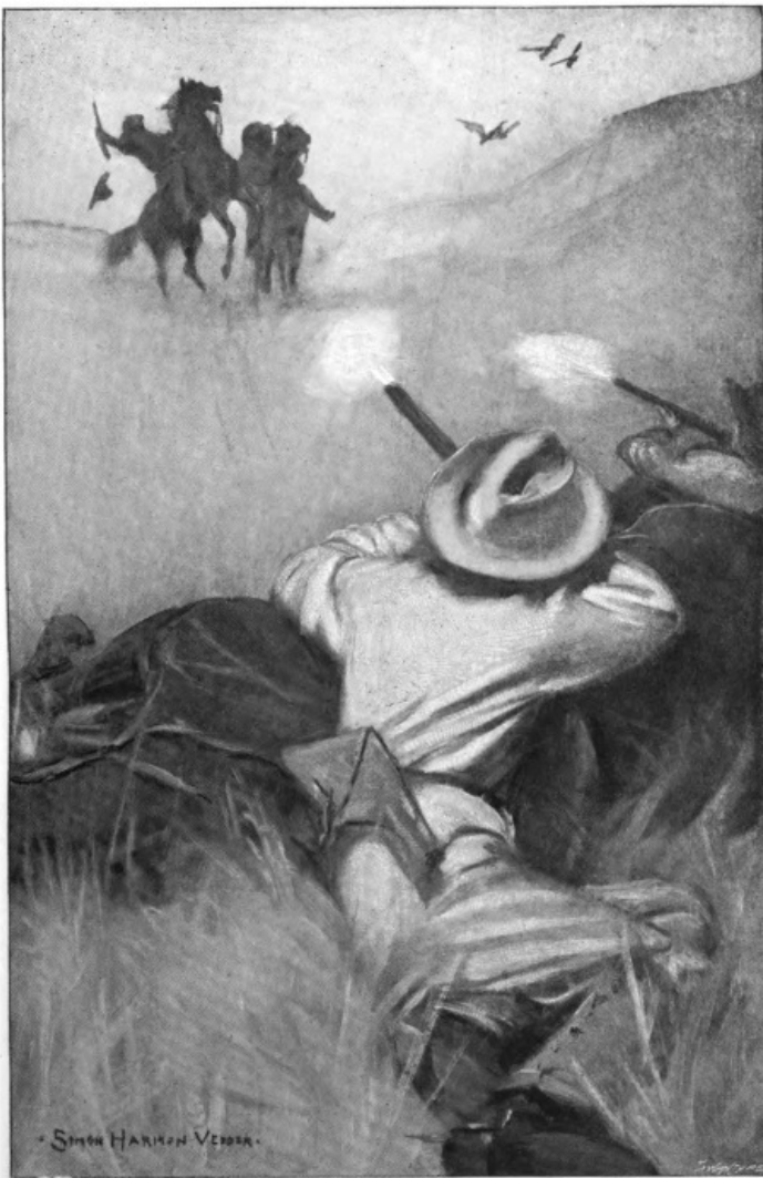
"THE TWO SHOTS RANG OUT TOGETHER, AND BOTH THE BOERS FELL LIFELESS."

The lads had their rifles fixed upon them, the two shots rang out together, both the Boers fell lifeless from the saddle, and the Dutch horses dashed back along the track by which they had come.