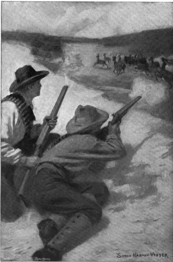
N 264 "TOM FIRED INTO THE THICK OF THE DEER AND ONE OF THEM FELL."

The two boys on his arrival leapt into their saddles and started in pursuit of the wounded stag, which was still in sight, thinking at first they could easily ride it down. But the animal seemed rather to gain than to lose strength, and, although they had considerably lessened the start he had obtained of them, he still kept steadily on. Active and wiry as their horses were, they could not overtake it, and the boys had at last the mortification of seeing that the stag was now gaining upon them, and they presently drew rein, and their panting horses came to a standstill.