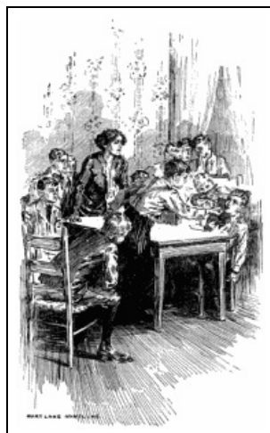
"Well, dad burn your looks, where'd you git all them marvles you been selling?"

Convinced but not satisfied, Taulbee frowned darkly. "Well, dad burn your looks, where'd you git all them marvles you been selling this spring," he demanded, "they never grewed on trees." The finger was no longer pointing, it was doubled up in a fist under Geordie's nose.