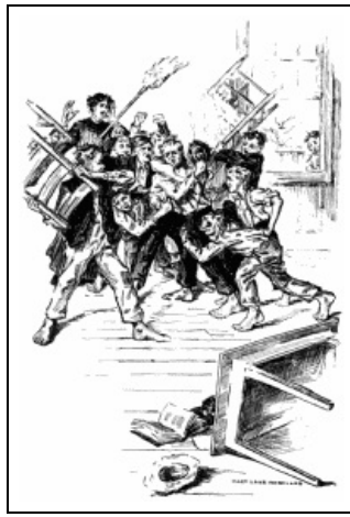
"The table was overturned, chairs were flying, bedlam had broken loose."