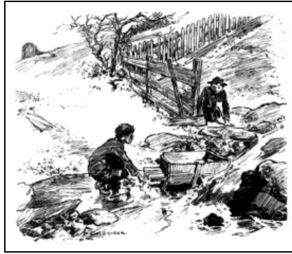
"I kotch him at it one time."

"Right there under the stable-lot fence, where the branch falls into Perilous, he took'n made him four little troughs, that takes streams out and draps 'em into four holes he's got hollered out in a flat rock underneath. All he's got to do is to put a chunk of sandstone in every hole, and the water keeps it a-whirling till first thing it knows it's a pure marvle; and then he puts in another chunk. He makes him twelve marvles a day thataway—it haint no trouble to drap in the chunks whilst he's watering the nags—and he's been at it stiddy for six weeks. I kotch him at it one time, and he give me a set not to tell t'other boys. Marvles! Gee-oh, he's got 'em!"