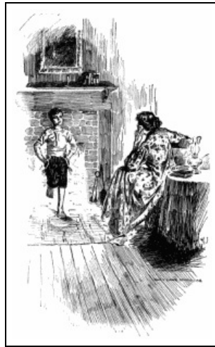
“Dag gone me , he's got use enough for little Dilsey, by Ned!”

"Dag gone me , he's got use enough for little Dilsey, by Ned! Gee, I never see the beat! He sot in a-courting her the day he got out from eech, and haint stopped to ketch his breath sence. Dad swinge my hide if that 'ere boy haint been nailing planks on that front fence with lee-tle-bitty fourpenny nails, so's the hogs'll root 'em off sure every night, and he'll git to work there and talk to Dilsey of a morning! I been keeping my eye peeled for him ever sence I seed him give her a' apple one day at recess,—I knowed then something had happened to him!"