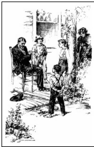
"My two assistants abandoned work to stare open-mouthed at him."

"How'd your paw git all lamed up thataway?"