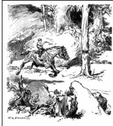
"I got a dead tree up the hollow I practice on all the time."

"Till I'm good and ready for him," replied Killis; "I got a dead tree up the hollow I practice on all the time,—there's a band breast-high around it black with bullet-holes. Sometimes I shoot walking, and sometimes running, and sometimes I fetch a nag up and gallop around and shoot. When I get so I never miss, I'll ride over where he lives at and tell him 'I'm Steve Blair's boy,' and shoot him down like a dog, and revenge my paw, and do my duty."