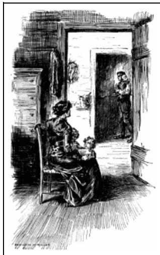
"As I looked, I said to myself over and over, 'Is it possible this is the slayer of men, an eluder and defier of the law?'"