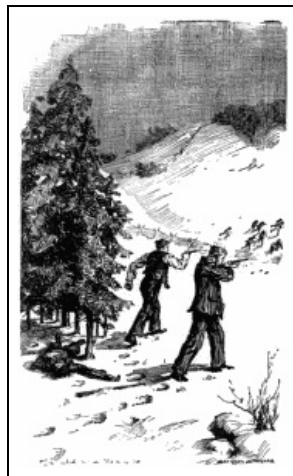
"Blant he rushed on 'em like a robbed she-bear, routing 'em in no time."

"Then he still does breathe?" I asked, fiercely.