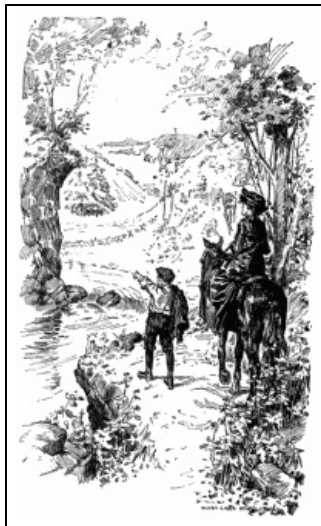
"That's where I keep lookout of moonlight nights when war is on."

He pointed to a thick, dark clump of hemlock near the foot of the spur, on the Marrs land. "That's where I keep lookout of moonlight nights when war is on," he said.