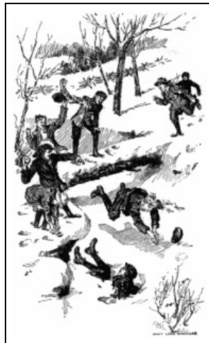
"The first real snow yesterday, and the boys wild in consequence."