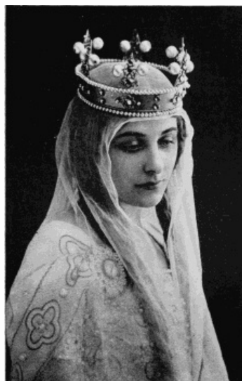
GERALDINE FARRAR AS ELISABETH

Notwithstanding the fact that she has written a rather dull book, Geraldine Farrar is one of the few really vivid personalities of the contemporary lyric stage. To a great slice of the public she is an idol in the sense that Rachel and Jenny Lind were idols. She has frequently extracted warm praise even from the cold-water taps of discriminating and ordinarily unsympathetic critics. Acting in opera she considers of greater importance than singing. She once told me that she ruthlessly sacrificed tone whenever it seemed to interfere with dramatic effect. As an actress she has suffered from an excess of zeal, and an impatience of discipline. She composes her parts with some care, but frequently overlays her original conception with extravagant detail, added spontaneously at a performance, if her feelings so dictate.