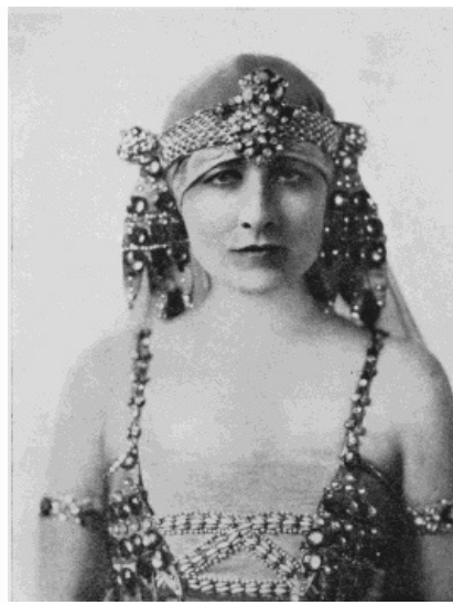
MARY GARDEN AS CLÉOPÂTRE (1919)

It seems necessary to speak of the portraits she has added to her gallery since the fall of 1917. Since then she has been seen in Février's Gismonda , Massenet's Cléopâtre , and Montemezzi's l'Amore dei Tre Re . The first of these is a very bad opera; it is not even one of Sardou's best plays. The part afforded Miss Garden an opportunity for the display of pride, dignity, and authority. Her gowns were very beautiful—I remember particularly the lovely Grecian drapery of the convent scene, which she has since developed into a first-act costume for Fiora; she made a handsome figure of the woman, but the thing itself was pasteboard and will soon be forgotten. The posthumous Cléopâtre was nearly as bad, but in the scene in which the queen, disguised as a boy, visits an Egyptian brothel and makes love to another boy, Mary was very startling, and the death scene, in which, after burying the asp in her bosom, she tosses it away with a shudder, sinks to the ground, then crawls to Antony's side and expires below his couch, one arm waving futilely in the air in an attempt to touch her lover, was one of her most touching and finest bits of acting. Her pale face, her green eyelids combined to create a sinister make-up. But, on the whole, a dull opera, and not likely to be heard again.