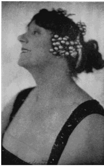
YVETTE GUILBERT