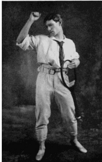
WASLAV NIJINSKY IN DEBUSSY'S JEUX (1913)