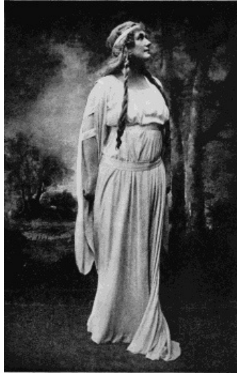
OLIVE FREMSTAD AS ELSA

The high tessitura of the music allotted to the Siegfried Brünnhilde is a strain for most singers. Mme. Nordica once declared that this Brünnhilde was the most difficult of the three. Without having sung a note in the early evening, she must awake in the third act, about ten-thirty or eleven, to begin almost immediately the melismatic duet which concludes the music drama. Mme. Fremstad, by the use of many expediences, such as pronouncing Siegfried as if it were spelled Seigfried when the first syllable fell on a high note, was able to get through with this part without projecting a sense of effort, unless it was on the high C at the conclusion, a note of which she frequently allowed the tenor to remain in undisputed possession. But the fierce joy and spirited abandon she put into the acting of the rôle, the passion with which she infused her singing, carried her victoriously past the dangerous places, often more victoriously than some other singer, who could produce high notes more easily, but whose stage resources were more limited.