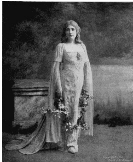
MARY GARDEN AS MÉLISANDE

"We interpreters of Debussy's lyric drama were naturally very proud, because we felt that we were assisting in the making of musical history. Maeterlinck, by the way, has never seen the opera. He wished his wife, Georgette Leblanc, to 'create' the rôle of Mélisande, but Debussy and Carré had chosen me, and the poet did not have his way. He wrote an open letter to the newspapers of Paris in which he frankly expressed his hope that the work would fail. Later, when composers approached him in regard to setting his dramas to music, he made it a condition that his wife should sing them. She did appear as Ariane, you will remember, but Lucienne Bréval first sang Monna Vanna, and Maeterlinck's wrath again vented itself in pronunciamientos."