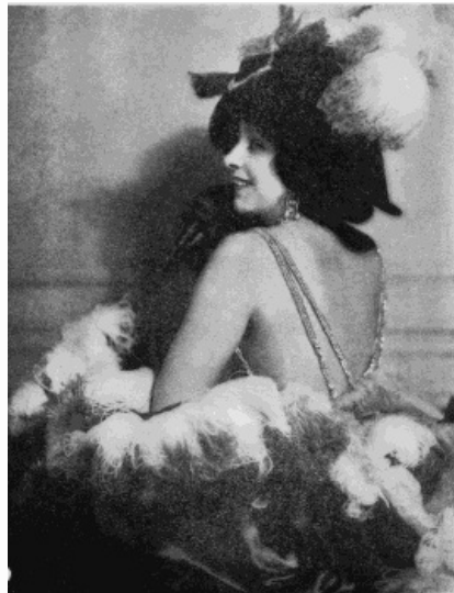
GERALDINE FARRAR AS ZAZA from a photograph by Geisler and Andrews (1920)

Certainly Yvette Guilbert failed magnificently in Guibour . I have been told that her infrequent performances in comedy in Paris have been equally unsuccessful. When Guilbert sings a song she is forced by the very nature of her method to make much of little; without setting, frequently without costume, without the aid of other actors, she is obliged in a period of three or four minutes to give her public an atmosphere, several characters, and a miniature drama. Now, taking into consideration the average low rate of intelligence and the almost entire lack of imagination of the ordinary theatre audience, she is compelled to chuck in as much detail as the thing will hold. The result is generally admirable. In a play, however, this method becomes monotonous, tiresome, picayune, fussy, overelaborate. One does not want the lift of an eyelash, a gesture with every line; one does not want emphasis on every word. The great actors employ broader methods. It was here that Madame Guilbert failed, by applying the extremely efficacious technique of her own perfect craft to another craft which calls for another technique.