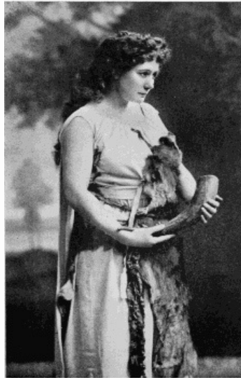
OLIVE FREMSTAD AS SIEGLINDE

did she sing the music well. On the other hand, her abundantly beautiful and voluptuous Venus, a splendid, towering, blonde figure, shimmering in flesh-coloured garments, was one of her astoundingly accurate characterizations. At the opposite pole to her Sieglinde it was equally a masterpiece of interpretative art, like Duse's Camille "positively enthralling as an exhibition of the gymnastics of perfect suppleness and grace." In both these instances she was inspired perhaps to realize something a little more wonderful than the composer himself had dreamed of. The depth and subtlety and refinement of intense passion were in this Venus—there was no suggestion here of what Sidney Homer once referred to as Mme. Homer's platonic Venus!