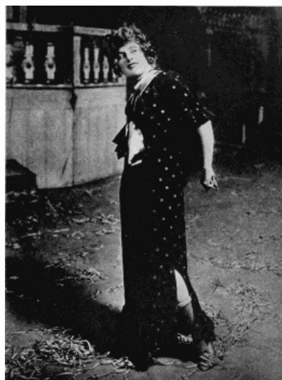
GERALDINE FARRAR AS LOUISE IN JULIEN

What a charming figure she was in Wolf-Ferrari's pretty operas, Le Donne Curiose and Suzannen's Geheimniss! And she sang the lovely measures with the Mozartean purity which at her best she had learned from Lilli Lehmann. Her Zerlina and her Cherubino were delightful impersonations, invested with vast roguery, although in both parts she was a trifle self-conscious, especially in her assumption of awkwardness. Her Elisabeth, sung in New York but seldom, though she has recently appeared in this rôle with the Chicago Opera Company, was noble in conception and execution, and her Goosegirl one of the most fascinating pictures in the operatic gallery of our generation. Her Mignon was successful in a measure, perhaps not an entirely credible figure. Her Nedda was very good.