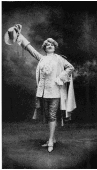
MARY GARDEN AS CHÉRUBIN (1905)