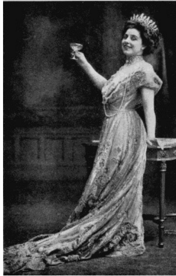
GERALDINE FARRAR AS VIOLETTA

was a consumptive; consequently, she must have been pale. In the third act Mme. Farrar achieved a very fine dramatic effect with her costume and make-up. Her face was painted a ghastly white, a fact emphasized by her carmined lips and her black hair. She wore pale yellow and carried an enormous black fan, behind which she pathetically hid her face to cough. She introduced novelty into the part at the very beginning of the opera. Unlike most Violettas, she did not make an entrance, but sat with her back to the audience, receiving her guests, when the curtain rose.