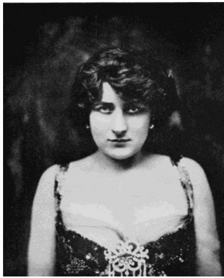
MARY GARDEN AS FANNY LEGRAND (1909)