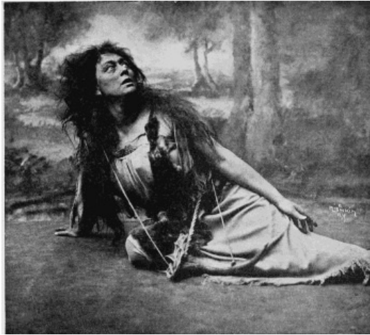
OLIVE FREMSTAD AS KUNDRY, ACT I from a photograph by Mishkin (1913)

In the complex rôle of Kundry Mme. Fremstad has had no rival. The wild witch of the first act, the enchantress of the second, the repentant Magdalene of the third, all were imaginatively impersonated by this wonderful woman. Certain actors drop their characterizations as soon as the dialogue passes on to another; such as these fail in Parsifal , for Kundry, on the stage for the entire third act, has only one word to sing; in the first act she has but few more. Colossally alluring in the second act, in which she symbolized the essence of the "eternal feminine," Mme. Fremstad projected the first and third act Kundry into the minds and hearts of her audience.