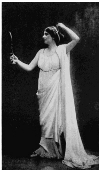
MARY GARDEN AS CHRYSIS (1906)

Camille Erlanger's Aphrodite , considered as a work of art, is fairly meretricious. As a theatrical entertainment it offers many elements of enjoyment. Based on the very popular novel of Pierre Louÿs—at one time forbidden circulation in America by Anthony Comstock—it winds its pernicious way through a tale of prostitution, murder, theft, sexual inversion, drunkenness, sacrilege, and crucifixion, and concludes, quite simply, in a cemetery. The music is appallingly banal, and has never succeeded in doing anything else but annoy me when I have thought of it at all. It never assists in creating an atmosphere; it bears no relation to stage picture, characters, or situation. Both gesture and colour are more important factors in the consideration of the pleasurable elements of this piece than the weak trickle of its sickly melodic flow.