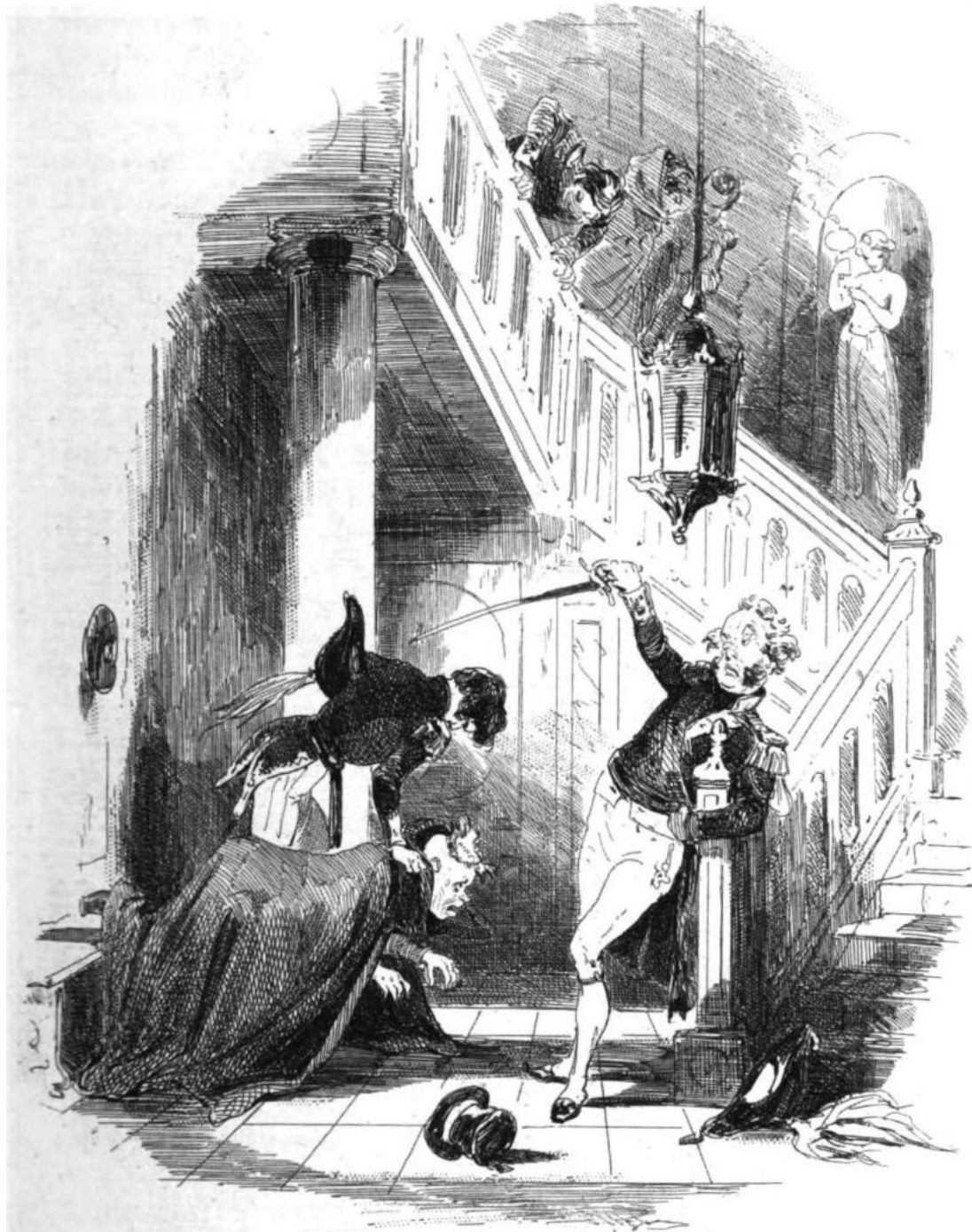
The Duke Knighting Corny Delany.

Leaving Corny to his lamentations, the duke walked towards the door. Here above a hundred people were now assembled, their curiosity excited in no small degree by a picket of light dragoons, who occupied the middle of the street, and were lying upon the ground, or leaning on their saddles, in all the wearied attitudes of a night-watch. In fact, the duke had forgotten to dismiss his guard of honour, who had accompanied him to the theatre, and thus had spent the dark hours of the night keeping watch and ward over the proud dwelling of the Rooneys. A dark frown settled on the duke's features as he perceived the mistake, and muttered between his teeth, 'How they will talk of this in England!' The next moment, bursting into a hearty fit of laughter, he stepped into the carriage, and amid a loud cheer from the mob, by whom he was recognised, drove rapidly away.