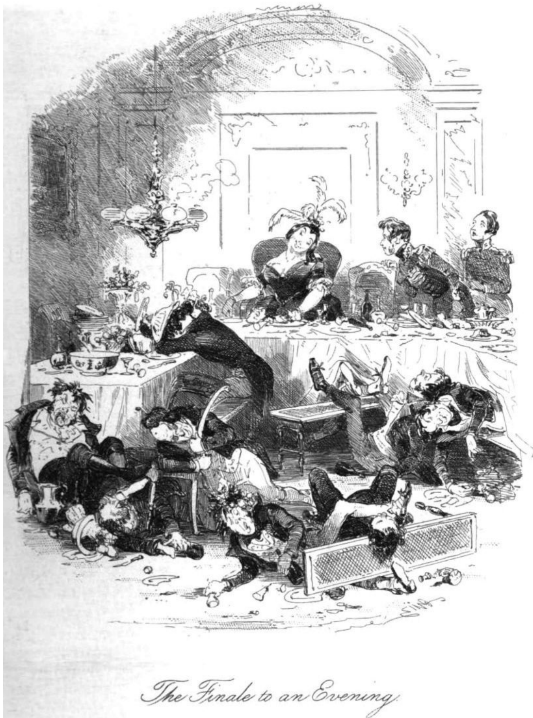
The Finale to an Evening.

'Where's Paul?' said O'Grady; 'where's Paul, Mrs. Rooney?' as he joggled her rather rudely by the arm.