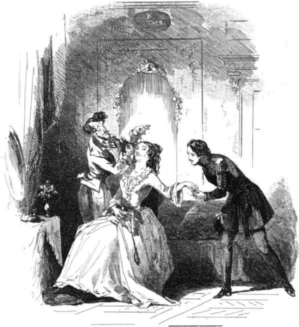
A Cutting reception!

We were now introduced into a large and splendidly furnished saloon, with all that lightness and elegance of decoration which in a foreign apartment is the compensation—a poor one sometimes—for the more comfortable look of our English houses. The room was empty, but the morning papers and all the new publications of the day were scattered about with profusion. Consigning my friend for a short time to these, I followed the femme de chambre , who had already brought in my card to my mother, to her ladyship's dressing-room. The door was opened noiselessly by the maid, who whispered my name. A gentle 'Let him come in' followed, and I entered.