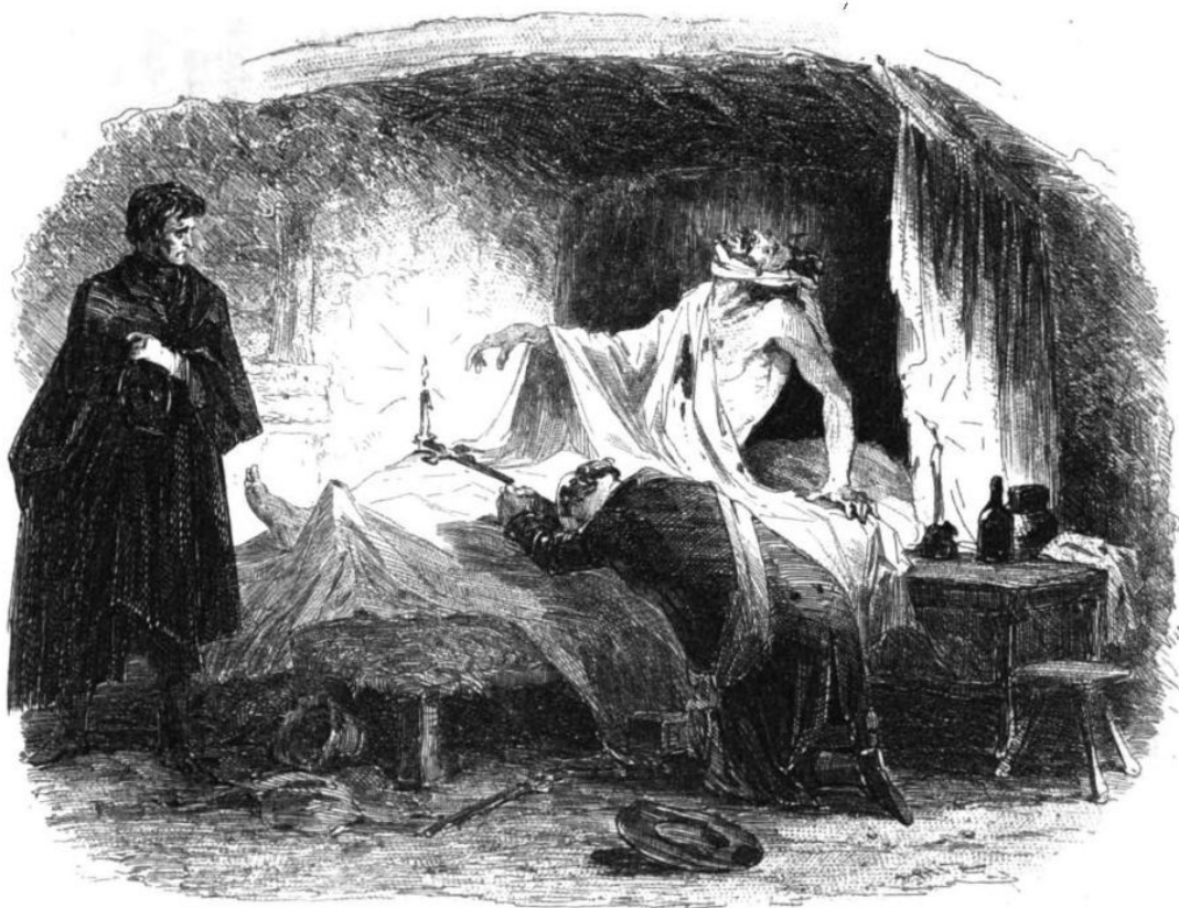
Death of Shaun

'O God!' he exclaimed, after a prayer of some minutes, in which his features worked like one in a fit of epilepsy—'O God, is it then too late?'