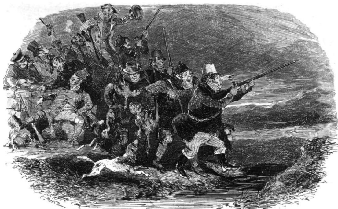
Irish Sport — with a Cockney.

"There they go—mark! That's yours, Tom! Well done—cock pheasant* by Jove! Here, Mr. Green! this way, Mr. Green! that dog is pointing—there, there! don't you see there?" said I, almost lifting the gun to his shoulder, while poor Mr. Green, almost in a panic of excitement and trepidation, pulled both triggers, and nearly fell back with the recoil.