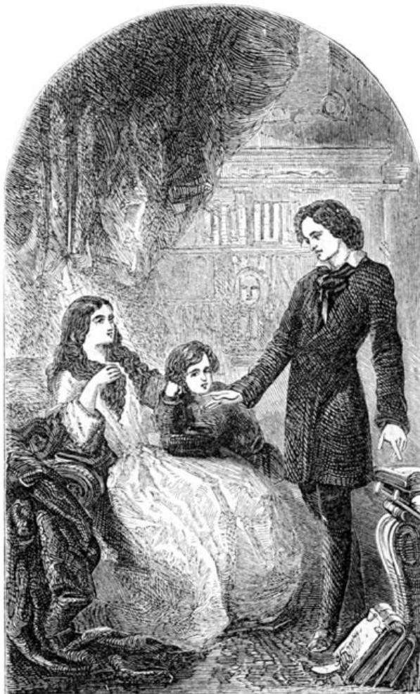
Charlie's Father talking to him.