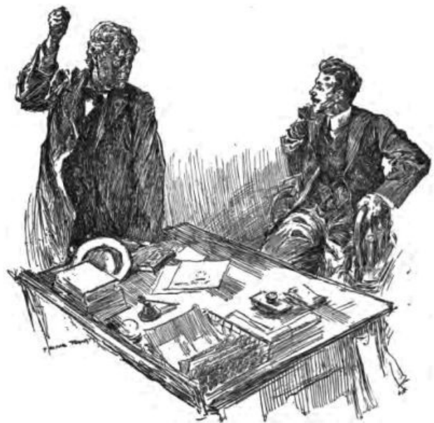
"Practical!" he explained. "You are a blackguard, sir! You are a scoundrel, sir!"

But the old Captain could no more understand Ed Smith than Ed could understand him. He would rather have laid his right hand upon living coals of fire than to have taken what he considered a "dirty dollar" for advertising. And yet in his day, no man in Westmoreland County was a keener political manipulator than he. He had traded his influence quite simply and frankly for the public printing. Was it not the natural reward of the faithful party worker? Had he not stumped the state for Blaine? Had not congressmen come to his door with their hats in their hands offering him favours in exchange for his support? And he had travelled always on railroad passes, as was his due as an influential editor, and voted, when a member of the legislature, with sincere belief [Pg 187]