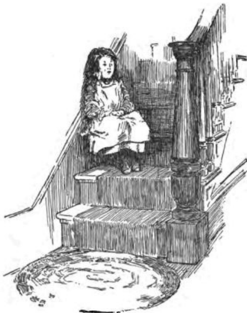
A very lonely little girl, sitting at a certain place on the third step from the bottom of the stairs