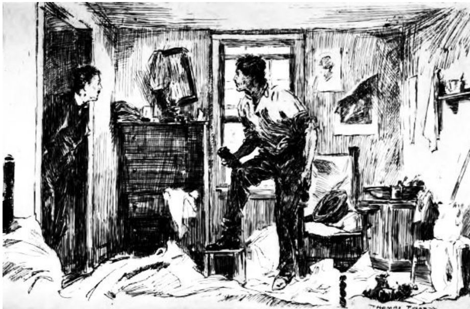
Ed's innocent suggestion of a house-cleaning was taken by Fergus as a deadly affront

At first Fergus, that thrifty Scotch soul, was inclined to look with favour upon these new activities, for they promised well for the future prosperity of the Star ; but this friendly tolerance was blasted as the result of a curious incident. Fergus had lived for several years in the back part of the printing-office. It was a small but comfortable room which had once been the kitchen of the house. In the course of his ravaging excursions, seeking what he might devour, Ed Smith presently fell upon Fergus's room. Ed never could understand the enduring solidity of ancient institutions. Now Fergus's room, I am prone to admit, was not all that might have been desired, Fergus being a bachelor; but he was proud of it, and swept it out once a month, as he said, whether it needed it or not. Ed's innocent suggestion, therefore, of a house-cleaning was taken by Fergus as a deadly affront. He did not complain to Anthy, though he told me , and from that moment he began a silent, obstinate opposition to everything that Ed was, or thought, or did.