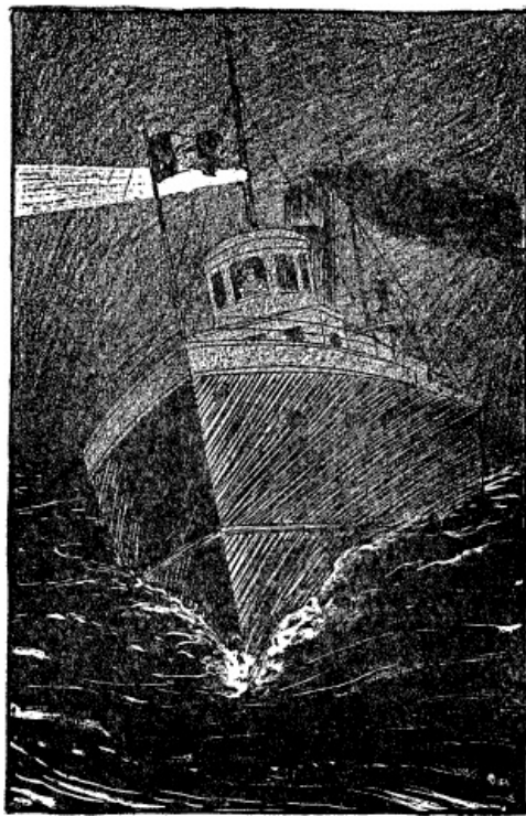
"The storm enveloped the vessel"

Nat signaled for full speed ahead, as he knew he would need all the steerageway possible to take the vessel through the waves that, every moment, were becoming larger.