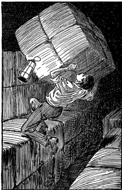
"He fell to the floor of the hold"

He fell to the floor of the hold, in a little aisle between two tiers of freight, and the bale was on top of him.