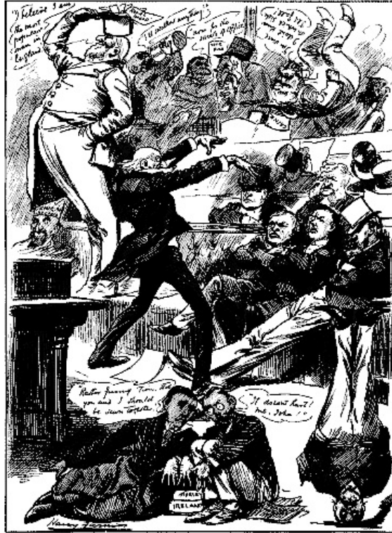
EXPERIMENTS BY THE GRAND OLD HYPNOTISER AT ST. STEPHEN'S.