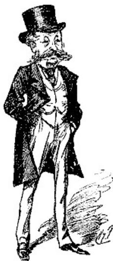
Minister of Education.

"Can't stand any more of it, TOBY. My hair positively beginning to frizzle under heat of blushes. Never suspected myself of being such Heavenborn Education Minister. But they all say it—MUNDELLA, PLAYFAIR, LUBBOCK, and even SAM SMITH. CRANBORNE and TALBOT not quite so sure; but on other side one chorus of approval. Bore it pretty well for hour or so; but at end of that time grows embarrassing. Just came out for little walk; look in again presently."