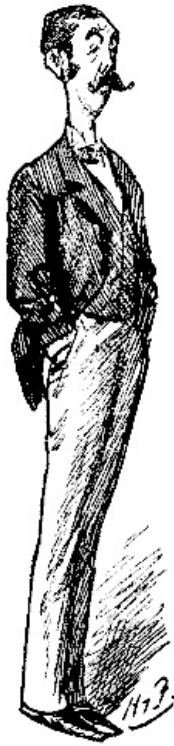
A Serious Young Man.

"Fact is, TOBY," he said, "BRADLAUGH's got his eye on that Bench. Means to sit there some day. Want him to know that even that sanctuary shall not preserve him from my wrath. Just getting my hand in. He'll be sorry he ever ventured to bite his thumb at me." Business done. —Education Vote in Committee.