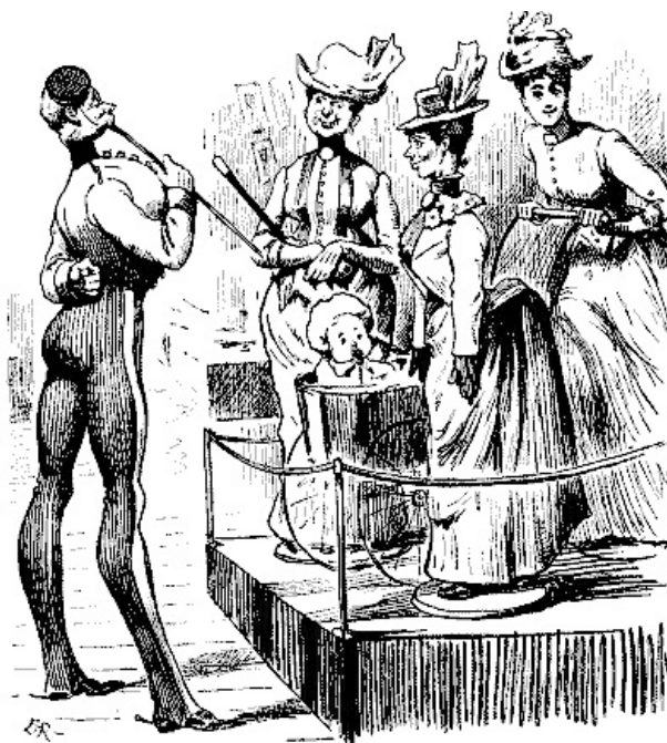
TOMMY'S "ARRIET" DEPARTMENT.

"SHORT NOTICE."—Those who did not hear Mr. GEORGE GROSSMITH'S entertainment at St. James's Hall last Saturday week lost a very great treat. There must have been thousands in London at the moment who suffered this deprivation. Our Special Noticer was among the number. Let us hope GEE-GEE will do it again, and all shall be forgiven.