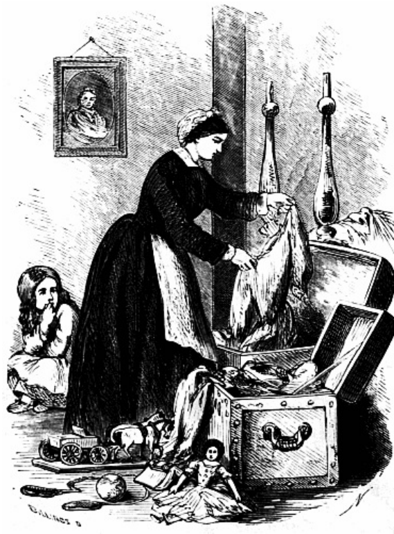
UNPACKING NELLY'S TRUNKS.