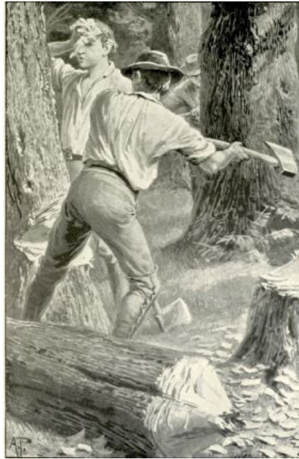
WILFRID AND THE GRIMSTONES FIND IT HARD WORK

"Do you never mean to settle down, Mr. Atherton?" Mrs. Mitford asked.