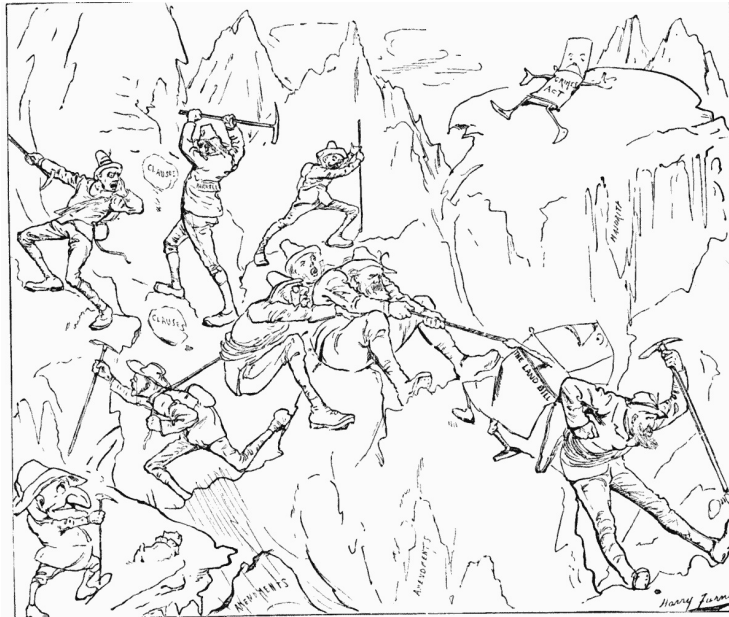
THE PARLIAMENTARY ALPINE CLUB.

Great muster on Opposition Benches in House of Commons. Conservatives not yet back from festivities in the Solent. Old Morality depressed with consciousness that it will be impossible for him to move the Closure. ARTHUR BALFOUR quite conciliatory in manner. Progress accordingly comparatively rapid and altogether peaceful. At outset, threatened encounter between SEXTON and JOHNSTON. SEXTON made inquiry as to whether any chance of City Charter being granted to Belfast? JOHNSTON jumped up with cry of "Stop thief!" On the Fourteenth of June—(didn't mention hour, but precise as to day)—he had put similar question, and had, he said, been waiting ever since for answer. Detected in SEXTON's movement attempt to secure monopoly of popularity. Not going to stand that. House only laughed, and incident went no further.