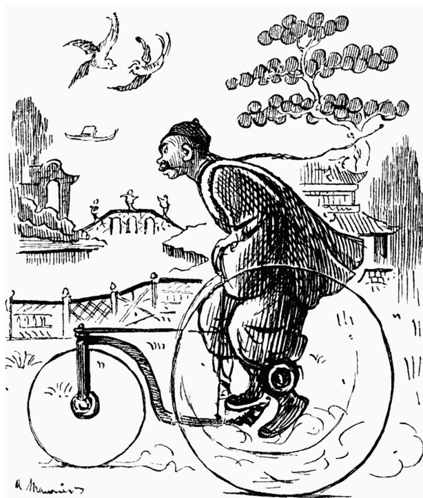
ILLUSTRATIONS TO THE POETS.