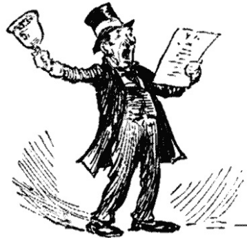
Read and A-bel. (Surrey.)