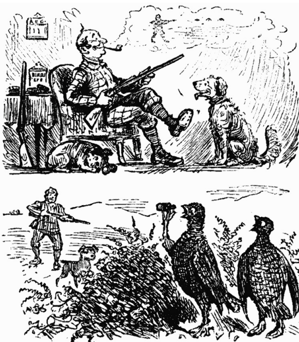
TWO "BIRDS'-EYE" VIEWS.