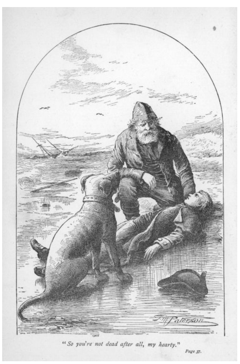
"So you're not dead after all, my hearty." Page 37

*** START OF THE PROJECT GUTENBERG EBOOK THE WRECKERS OF SABLE ISLAND ***