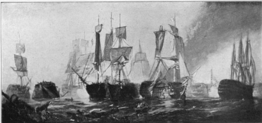
From the painting by Stanfield in the National Gallery, London.

{145} If the Colonies had still needed the protection of England from the French, they might never have questioned the propriety of their treatment. They were at heart intensely loyal, and the thought of severance from the Mother Country probably did not exist in a single breast. But they had since the fall of Quebec a feeling of security which was a good background for independence, if their manhood required its assertion. They were Anglo-Saxons, and perfectly understood the long struggle for civil rights which lay behind them. So when in 1765 they were told that they must bear their share of the burden of National Debt which had been increased by wars in their behalf, and to that end a "Stamp Act" had been passed, they very carefully looked into the demand. This Act required that every legal document drawn in the Colonies, will, deed, note, draft, receipt, etc., be written upon paper bearing an expensive Government stamp.