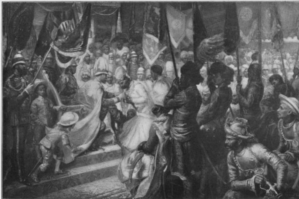
From the painting by Sidney Hall, P.M.A.

It was while that astute diplomatist, Disraeli (Lord Beaconsfield) was Prime Minister, that French money, skill and labor opened up the waterway between the Mediterranean and the Red Sea. It would never do to have France command such a strategic point on the way to the East. England was alert. She lost not a moment. The impecunious Khedive was offered by telegraph $20,000,000 for his interest in the Suez Canal, nearly one-half of the whole capital stock. The offer was accepted with no less alacrity than it was made. So with the Arabian Port of Aden, which she already possessed, and with a strong enough financial grasp upon impoverished Egypt to secure the right of way, should she need it, England had made the Canal which France had dug, practically her own.