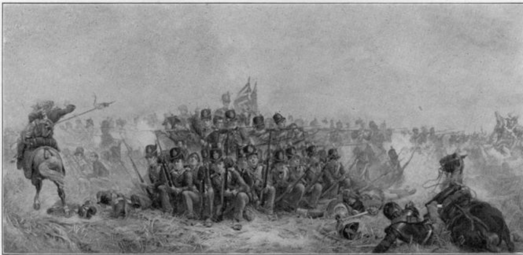
From the painting by Elizabeth Southerden Thompson.

The weight of the enormous debt incurred by the long wars fell most heavily upon the poor. One-half of their earnings went to the Crown. The poor man lived under a taxed roof, wore taxed clothing, ate taxed food from taxed dishes, and looked at the light of day through taxed window-glass. Nothing was free but the ocean.