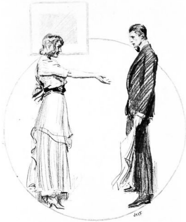
"He wants to see you now" she said"