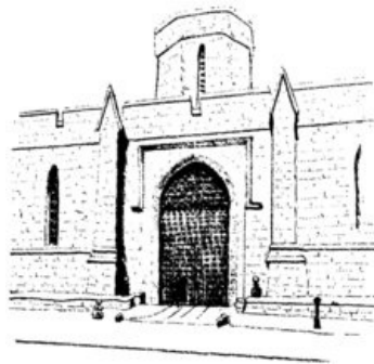
THE PHILADELPHIA BASTILE