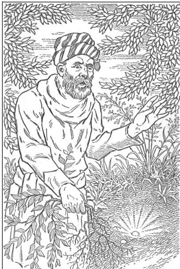
Acres of Diamonds