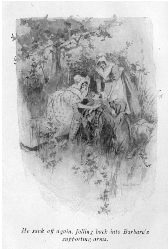
He sank off again, falling back into Barbara's supporting arms.