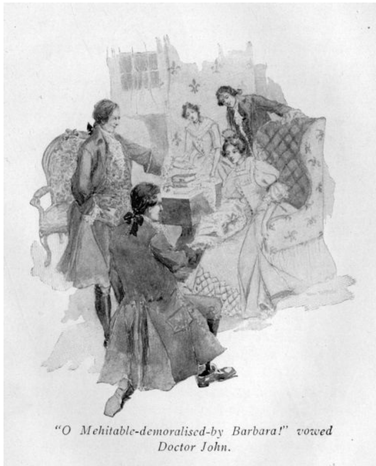
"O Mehitable-demoralised-by Barbara!" vowed Doctor John.