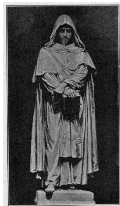
GIORDANO BRUNO. From the Statue in the Campo dei Fiori, Rome.

Transcriber's note: A few typographical errors have been corrected. They appear in the text like this, and the explanation will appear when the mouse pointer is moved over the marked passage.