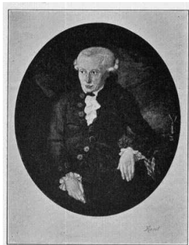
KANT.

Kant grew up among the Pietists, a school which played much the same part in Germany that the Methodists and the Evangelicals played in England; indeed, it was from them that John Wesley received his final inspiration. The Königsberg student came in time to discard their theology while retaining the stern Puritan morality with which it was wedded, and even, Rationalist as he became, some of their mystical religiosity. What drew him away to philosophy seems to have been first the study of classical philology and then physical science, especially as presented to him in Newton's works. And so the young man's first ambition, after settling down as a University teacher at Königsberg, was to extend the Newtonian method still further by explaining, on mechanical principles, the origin and constitution of that celestial system whose movements Newton had reduced to law, but whose beginning he had left unaccounted for except by—what was not science—the direct fiat of omnipotence.