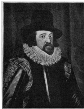
FRANCIS BACON.

When the first of these, Somerset, fell and was tried on a charge of murder, he conducted the prosecution, and, finding the evidence insufficient, suggested to James that the prisoner should be entrapped into a confession by dangling a false promise of forgiveness before his eyes. Bacon owed his final exaltation to Buckingham, and as Lord Keeper allowed himself to be made the tool of that bad man for the perversion of justice. A suit was brought before him by a young man against a fraudulent trustee (his own uncle) for the restitution of a sum of money. Bacon gave sentence for the plaintiff. Buckingham then intervened with a demand that the case should be retried. "Upon this Bacon saw the parties privately, and, annulling all the deliberate decisions of the Court, compelled the youth to assent to the ceasing of all proceedings, and to accept" a smaller sum than he was entitled to (E. A. Abbott). On another occasion he exercised his judicial authority in a way that did not square with Buckingham's wishes, but quite legitimately and without any consciousness of giving offence; whereupon the insolent favourite addressed him in a letter filled with outrageous abuse, to which Bacon replied in terms of abject submission. This meanness had its reward, for in 1618 the philosopher became Lord Chancellor.