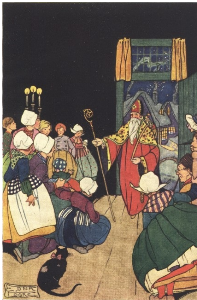
The door slowly opened

[Master Broom colored and stared in great astonishment.]