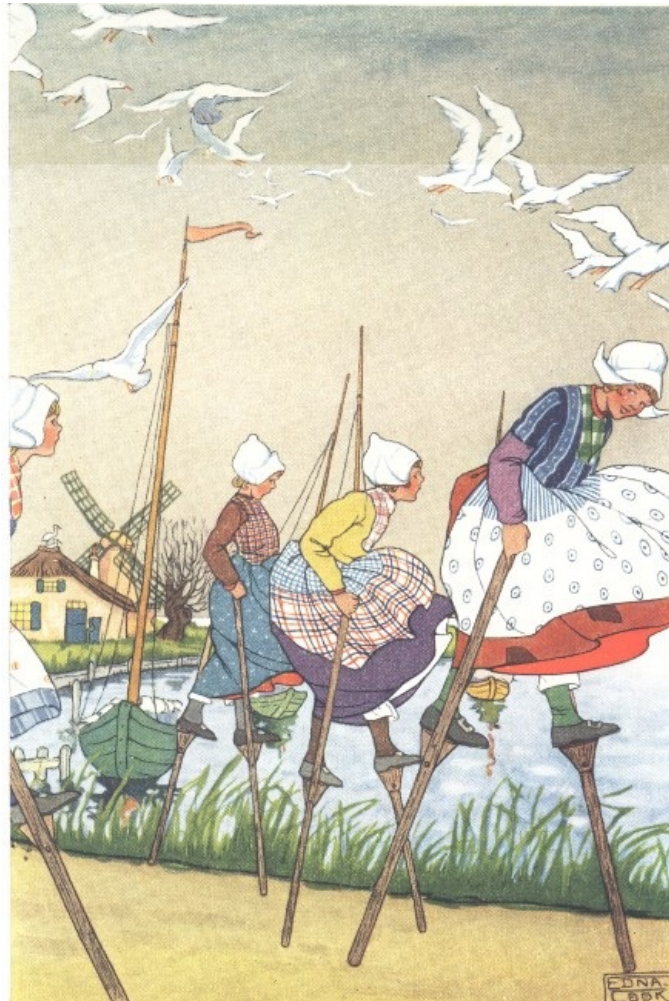
Gretel on her stilts (See page 29)