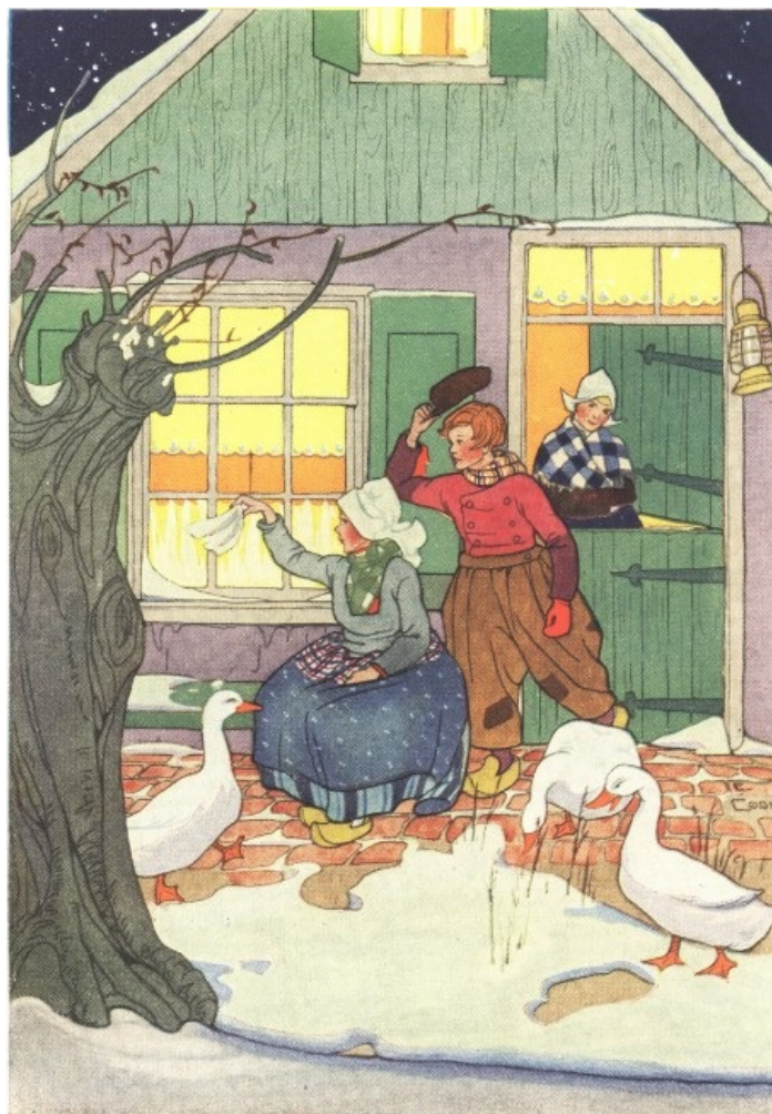
"Good-night," they cried