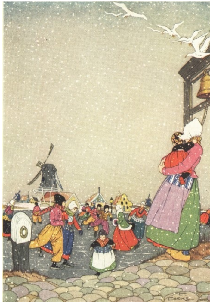
The ice seemed fairly alive

"It's true talk anyway," rejoined Lambert, so very quietly that Ben wisely resolved to make no further comment.