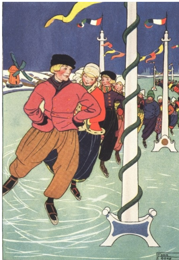
Skating slowly the boys and girls moved forward

It was beautiful to see the bright procession glide along like a living creature. It curved and doubled, and drew its graceful length in and out among the arches—whichever way Peter, the head, went, the body was sure to follow. Sometimes it steered direct for the centre arch, then, as if seized with a new impulse, turned away and curled itself about the first one; then unwound slowly and bending low, with quick, snake-like curvings, crossed the river, passing at length through the furthest arch.