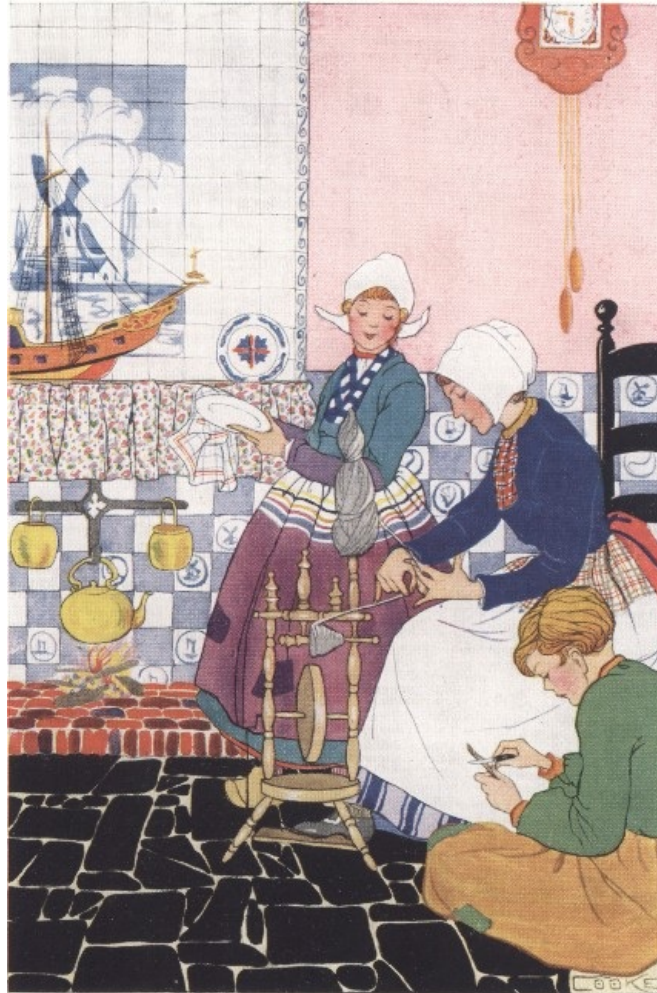
Hans was clever at carving in wood

There was the rich burgomaster's daughter Hilda van Gleck, with her costly furs and loose-fitting velvet sack; and, near by, a pretty peasant girl, Annie Bouman, jauntily attired in a coarse scarlet jacket and a blue skirt just short enough to display the gray homespun hose to advantage. Then there was the proud Rychie Korbes, whose father, Mynheer van Korbes, was one of the leading men of Amsterdam; and, flocking closely around her, Carl Schummel, Peter and Ludwig [7] van Holp, Jacob Poot, and a very small boy rejoicing in the tremendous name of Voostenwalbert Schimmelpenninck. There were nearly twenty other boys and girls in the party, and one and all seemed full of excitement and frolic.