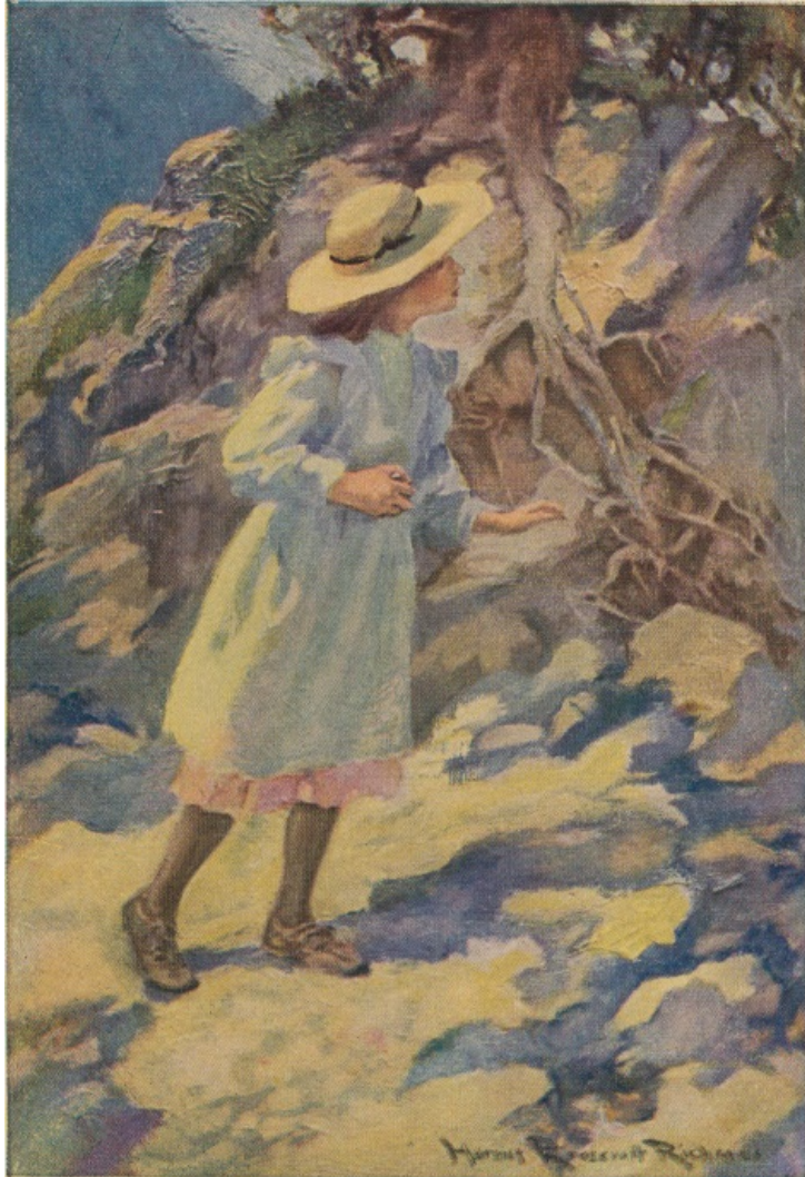
There she saw the very place she recollected so well. Page 257.

"Perhaps this land belongs to somebody who won't sell it. Perhaps he knows there is a mine here!" She looked all about, but she could not see any stakes set up to show that it was owned by any one: so she hoped it was not.