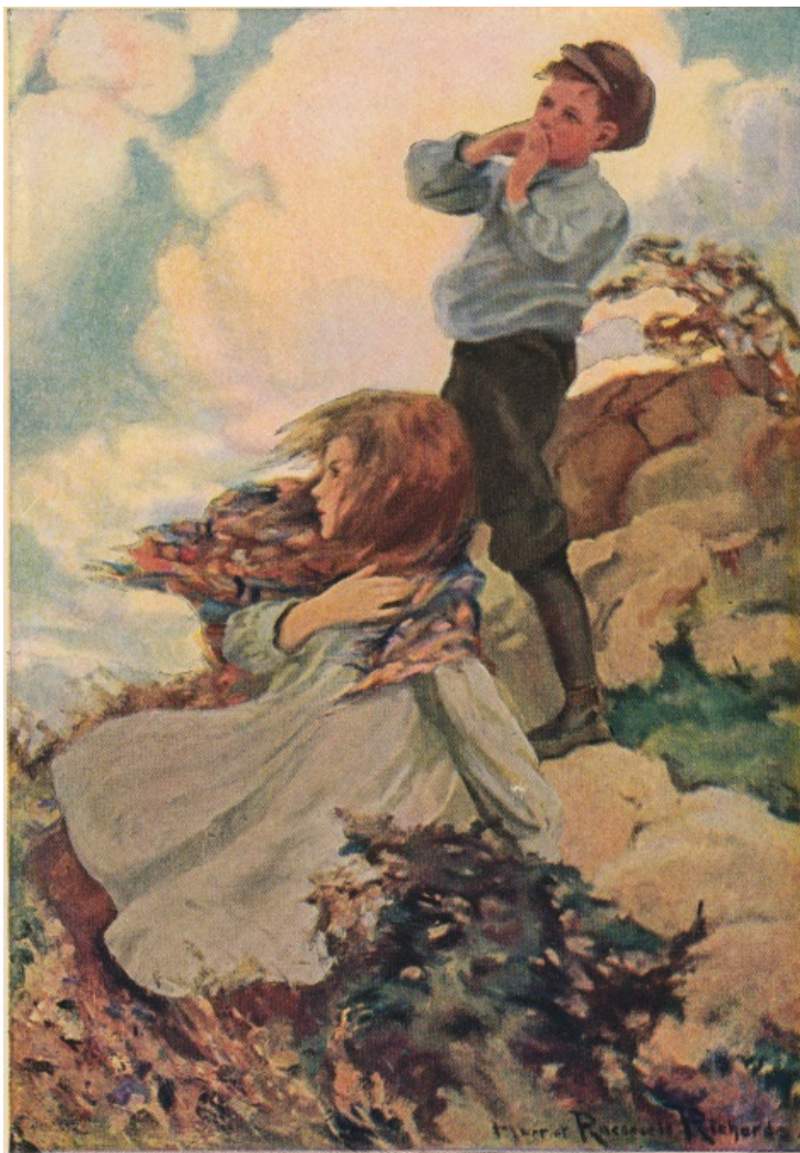
He would ring out such a "jodel", that the people would stop and look up amazed. Page 132.