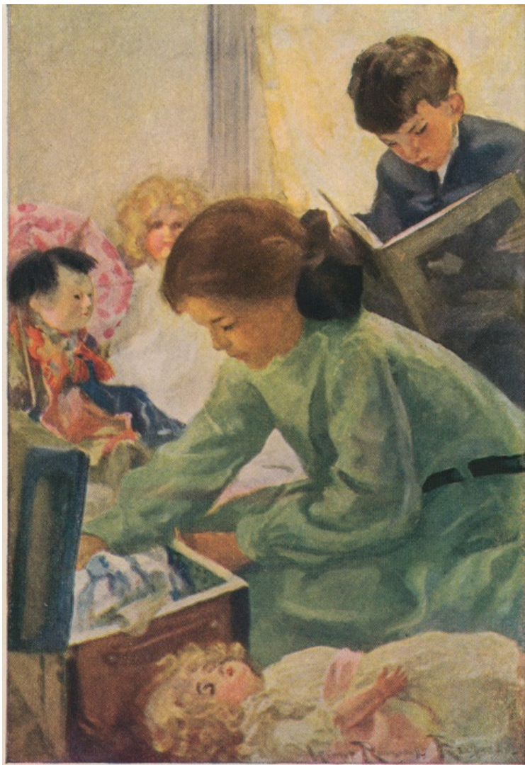
Nelly sat on one side with all her dolls ranged in a row against the wall. Page 20

After a while, Nelly leaned her head back against the wall, and stopped playing with her dolls. She looked at the snow-storm outside, and the bright fire in the grate, and exclaimed, "Oh, mamma! isn't it nice here?" [Pg 21]