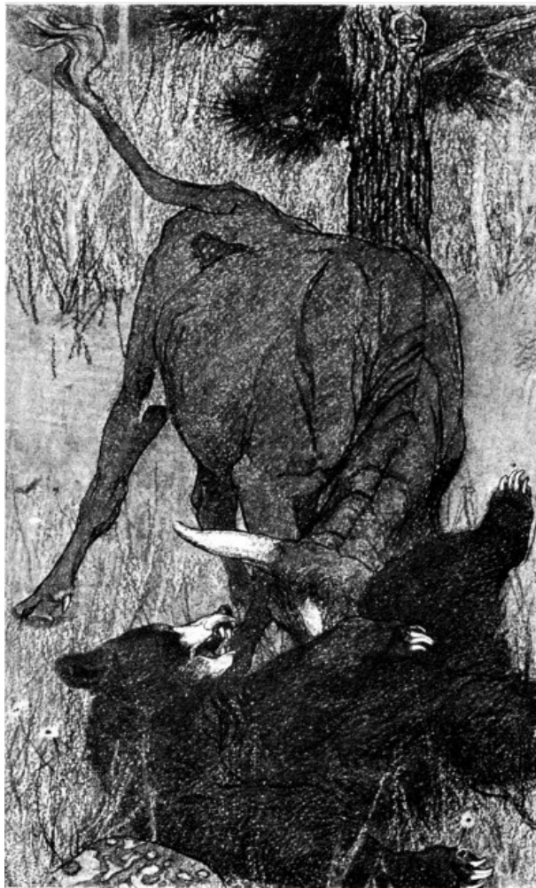
He launched himself into the battle.

The bear, absorbed in the fulness of her vengeance, was taken absolutely by surprise. It was as if a ton of rock had been hurled against her flank, rolling her over and crushing her at the same time. In his rage the great red ox seemed suddenly to develop an aptitude for the battle. Twisting his head, he buried one horn deep in his adversary's belly, where he ripped and tore with the all-destructive fury of a mad rhinoceros. The bear's legs closed convulsively about his head and shoulders, but in the next instant they relaxed again, falling away loosely as that ploughing horn reached and pierced the heart. Then Star drew back, and stood shaking his head to clear the blood out of his eyes. [Pg 133]