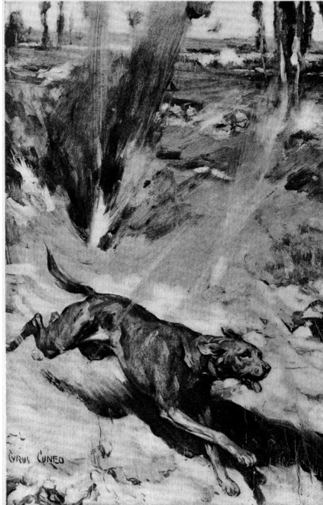
He only knew his lines were close ahead, and he must reach them.

Belgians turned a battery from harrying a far-off squadron of horse to shell the lines opposite, in defence of the little messenger. Men fell by the score on both sides to decide that unexpected contest.