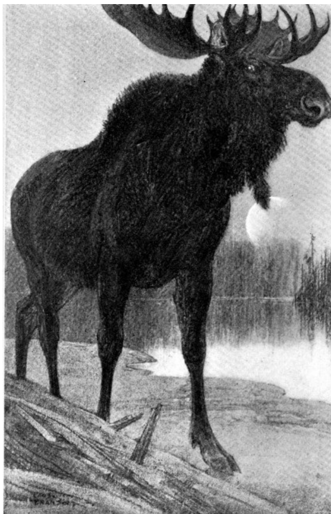
Black and huge against the pallid radiance towered a moose bull.

The great bull had a noble pair of antlers, a head for any hunter to be proud of, but Joe Peddler never raised his rifle. Instead of rejoicing at this response to his deceitful lure, a frown of impatience crossed his face. The strict New Brunswick game laws allowed but one bull in a season to fall to the rifle of any one hunter. Joe Peddler was in search of one particular bull. He had no use for the great beast towering so arrogantly before him, and nothing was further from his thoughts than to put a bullet into that wide-antlered head.