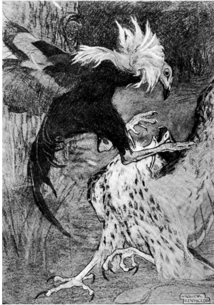
Leaping upwards and striking downwards with his destroying heels.

The insult, however, was lost upon the hawk, who had no knowledge of the cock's duelling code. He simply waited, motionless as the stump beside him.