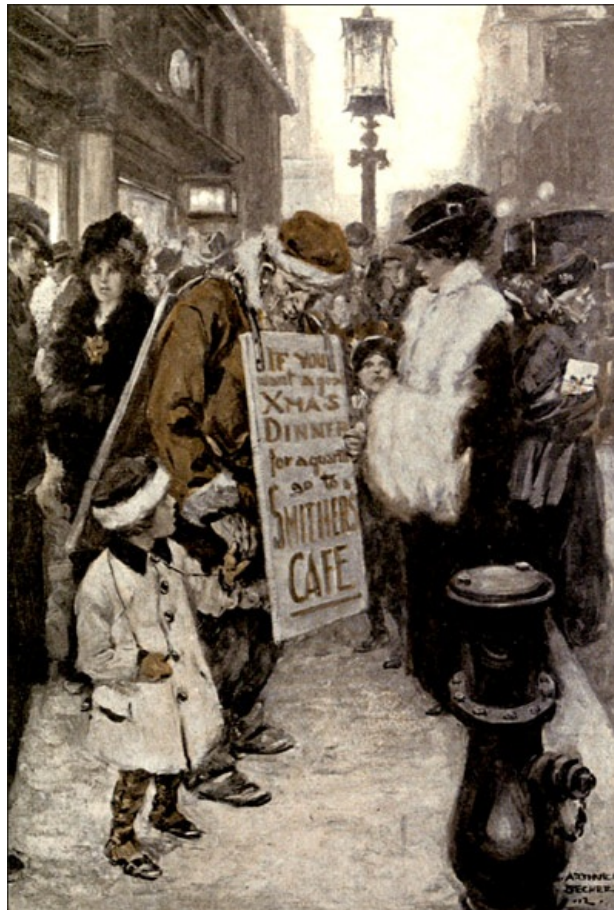
He thought it very strange that Santa