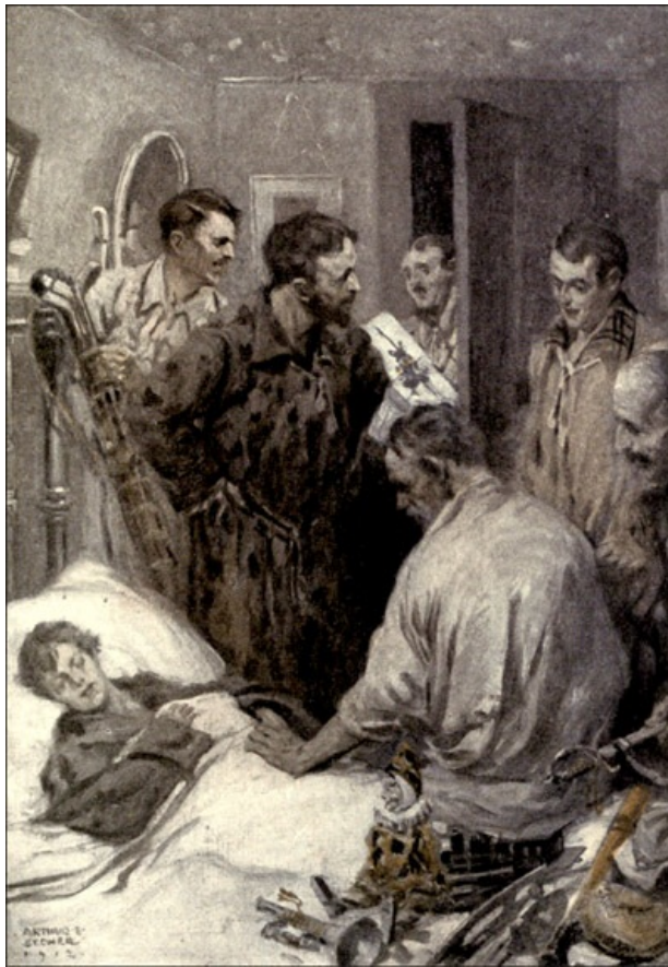
One by one the prisoners of the night dropped in surreptitiously. Page 155.

"Selling papers in winter doesn't give these babies exactly the sort of paddies you'd expect to find on a mollycoddle," said the doctor. [155]