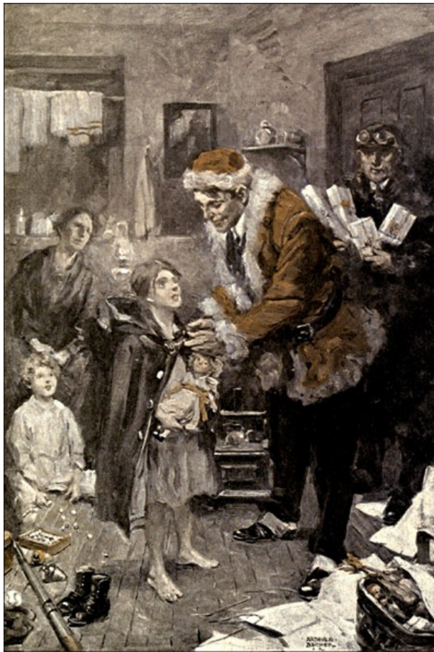
She stood with her eyes popping out of her head. Page 39.

Hetherington placed the little cloak with its beautiful brass buttons and its warm hood over the little girl's shoulders, while she stood with her eyes popping out of her head, too delightedly entranced to be able to say a word of thanks. [39]