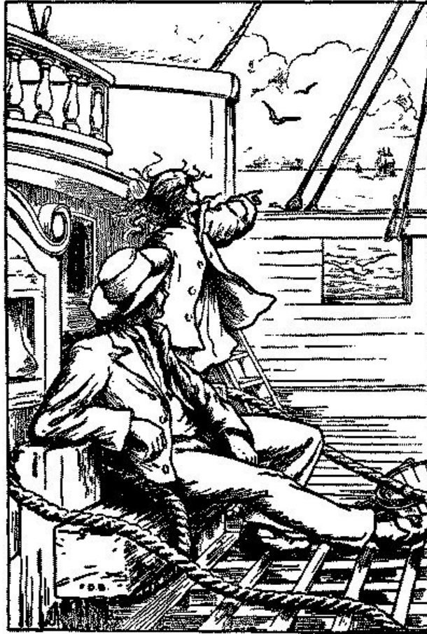
"He would show me all pretty sea-sights."

a deep green, and sometimes it would seem all on fire. All these various appearances he would show me, and attempt to explain the reason of them to me, as well as my young capacity would admit of. There were a lion and a tiger on board going to England as a present to the King, and it was a great diversion to Atkinson and me, after I had got rid of my first terrors, to see the ways of these beasts in their dens, and how venturous the sailors were in putting their hands through the grates, and patting their rough coats. Some of the men had monkeys, which ran loose about, and the sport was for the men to lose them, and find them again. The monkeys would run up the shrouds and pass from rope to rope, with ten times greater alacrity than the most experienced sailor could follow them, and sometimes they would hide themselves in the most unthought-of places, and when they were found, they would grin and make mouths, as if they had sense. Atkinson described to me the ways of these little animals in their native woods, for he had seen them. Oh, how many ways he thought of to amuse me in that long voyage!