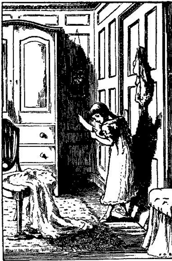
She read it with trembling impatience.

When Sophy had read these broken sentences she fancied that she fully comprehended the purport of the whole note, and she now saw the reason of her sister's hastening to Mr. McNeal's immediately on the receipt of the note, and of the hurry in which he had been summoned back to his shop. It appeared very clear to her that he had defrauded Mrs. Arden of a considerable sum of money, and that he was no longer that honest tradesman he had been supposed. The weight of this important discovery quite overburdened her, and, forgetful of her past punishment, and regardless of future consequences, she imparted the surprising secret to Sally. Sally was not one who could keep such a piece of news to herself; it was therefore soon circulated through half the town that Mr. McNeal had defrauded Mrs. Arden, and that Mr. Arden declared he would have him hanged for it. Several persons in consequence avoided Mr. McNeal's shop, who saw his customers forsaking him without being able to know why they did so. Thus the conduct of this inconsiderate girl took away the good name of an honest tradesman, on no better foundation than her own idle conjectures drawn from the torn fragments of a letter.