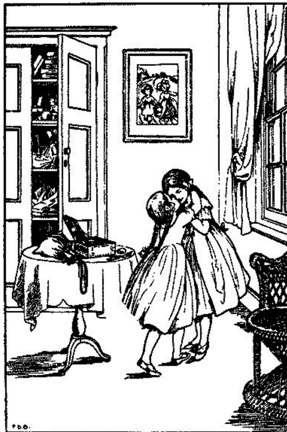
Agnes threw her arms round the neck of her dear Laura.

Agnes tripped away with light steps and a merrier heart than she expected would be her companion to her uncle's. The carriage was shortly after ready, and the cousins in half an hour were together. Oh, how grateful did Agnes feel to her mother when Laura met her! In Laura's arms was the box of shells which she had received from her uncle abroad, and which was now quite full; for Laura had denied herself everything that she might complete the collection, and she now presented it, with a feeling of calm and quiet pleasure, to her beloved cousin. Agnes felt ashamed and pleased, humbled and gratified, as she threw her arms round the neck of her dear Laura to thank her, and as she presented to the delighted girl, in return for her beautiful box of shells, the thimble, the scissors, the needle-case, the winders, the pincushion, and the little blue bag.