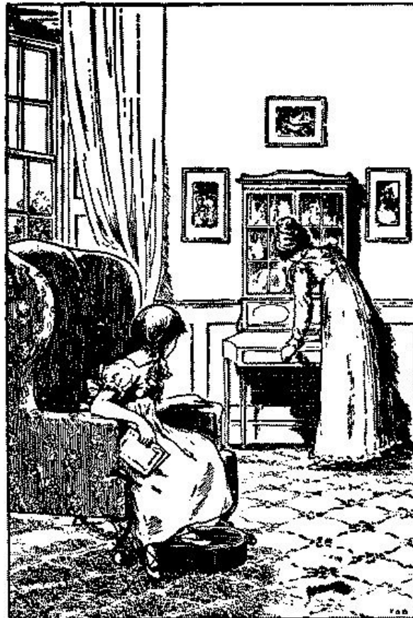
If Louisa received a note she carefully locked it up.

If Louisa received a note she carefully locked it up, and never spoke of its contents before Sophy. If a message was brought to her she always went out of the room to receive it, and never suffered the servant to speak in her sister's hearing. When any visitors came Louisa commonly sent Sophy out of the room, or if they were intimate friends she would converse with them in whispers; in short, it was her chief study that everything which passed in the family should be a secret from Sophy. Alas! this procedure, instead of repressing Sophy's curiosity, only made it the more keen; her eyes and ears were always on the alert, and what she could not see, hear, or thoroughly comprehend she made out by guesses.