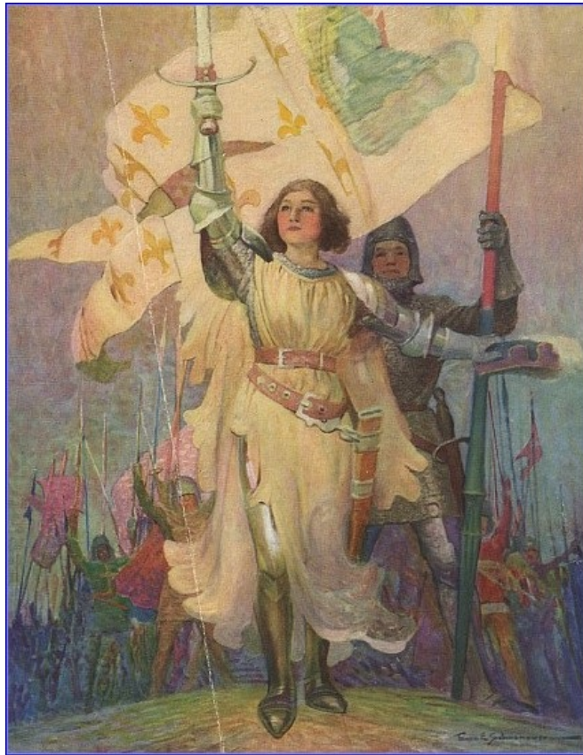
THE WARRIOR MAID