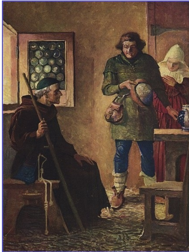
"THE HOLY MAN HAS BEEN TO ROME"

"From Rome?" ejaculated Jacques D'Arc, turning round with eagerness. "Hear you that, Isabeau? The holy man has been to Rome. Hasten with the supper; he must be hungry." With this he busied himself to make the priest more comfortable. To make a pilgrimage to Rome cast a glamour of sanctity about him who made it, and exalted him in the eyes of all men.