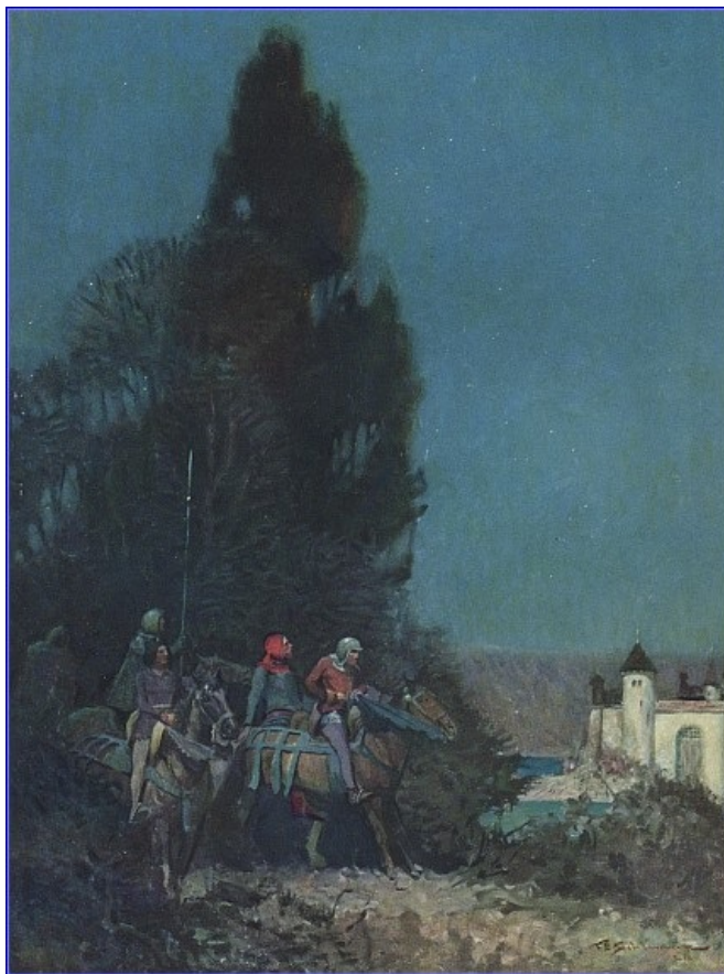
FAR INTO THE NIGHT THEY RODE

But Jeanne turned a smiling face toward him; a face as blithe and bright as that of a fair youth.