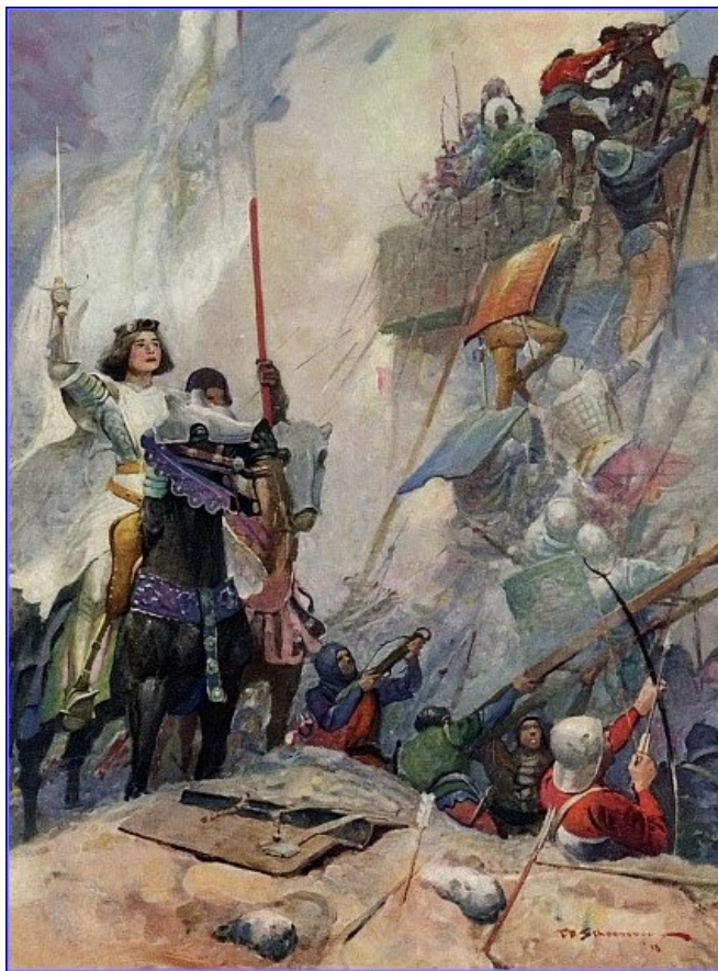
“FRANCE AND ST. DENYS!”

Again and again the ladders were flung down, the climbers were shot, or smitten, or grappled with and dashed into the fosse. Valiantly the English fought with bow-shot and gunshot, with axes, lances, bills, and leaden maces, and even with their fists, so that there were many killed and wounded. But like Antaeus, of whom it was fabled that being a son of the goddess, Tellus, or the earth, every fall he received from Hercules gave him more strength, so the French returned to the charge after every repulse with such vigour that it was marvellous to behold. The air was filled with shouts and cries of the captains: “France and St. Denys!” “St. George for England!” It whirled to the singing of arrows, the twang of bowstrings, the clang of axes on armour, and the roar of guns.