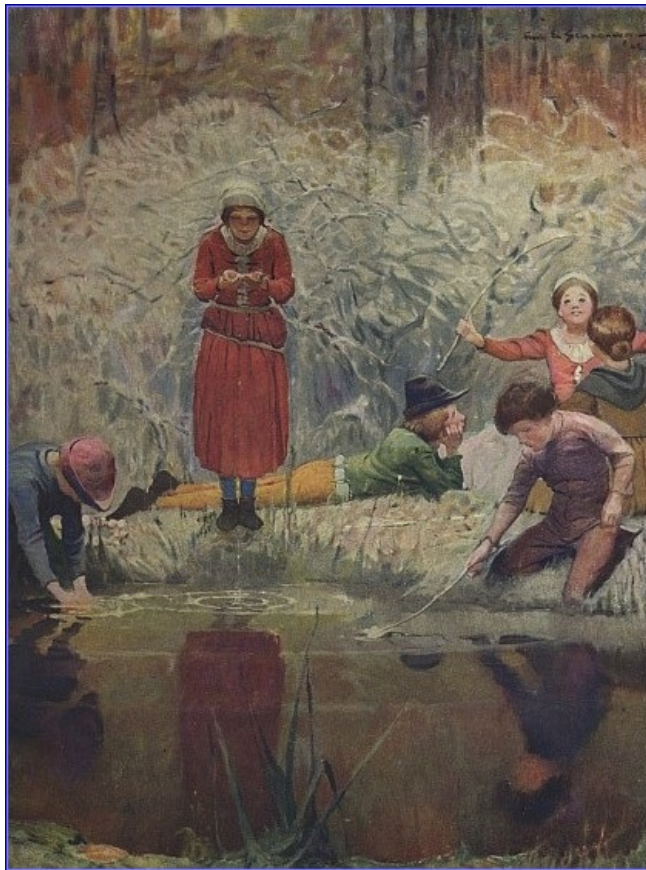
THE GOOSEBERRY SPRING

For a brief time only did the children stand about the boy, and then with one accord, though no word was spoken, they formed their line again, and started for the Spring. Colin followed after shamedfacedly.