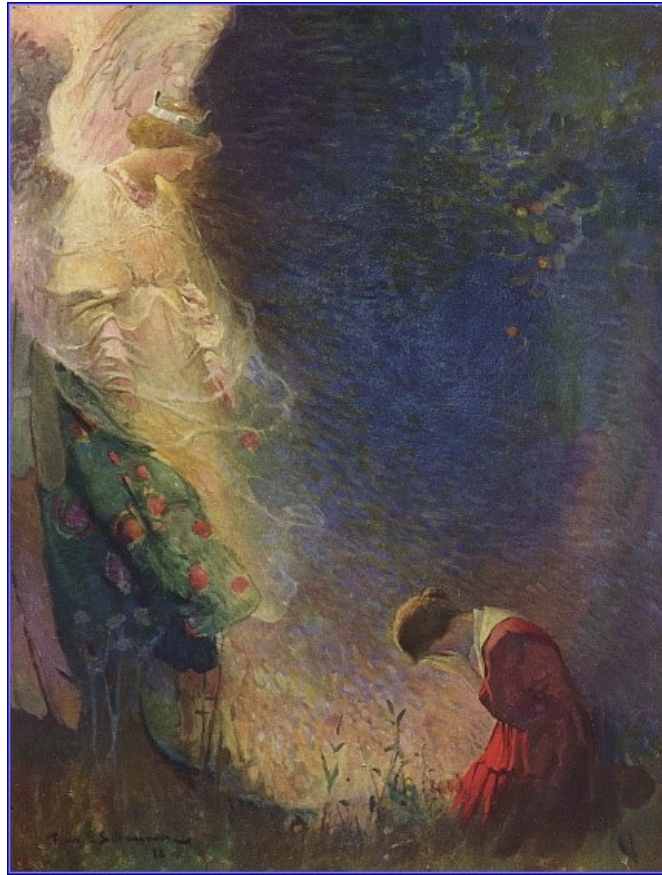
OFTEN THEY APPEARED IN THE LITTLE GARDEN

"Nay," came the answer. "Thy time is not yet, Daughter of God. Thy work is yet to be done."