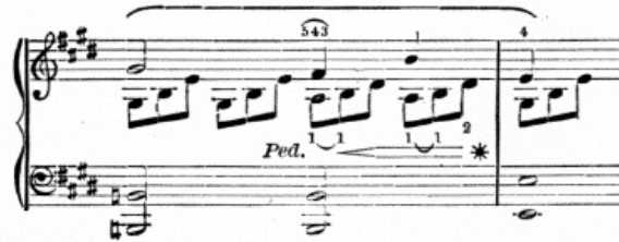
Beethoven's "Moonlight Sonata" [Listen]

the passage also becomes harmony, since it is an example of the rational combination of several tones. As has often been pointed out in books on music, and probably often will have to be pointed out again, because as a mistake it is to be classed with the hardy perennials, melody is not harmony, but only a part of it. When, however, a composer conceives a theme or melody he usually does so with the purpose of combining it with an accompaniment that shall support it and throw it into bold and striking relief. Composers of the contrapuntal school, on the other hand, conceived a theme, not for the purpose of supporting it with an accompaniment, but in order to combine it with another or with several other equally important themes. That, in a general way, is the difference between harmony and counterpoint.