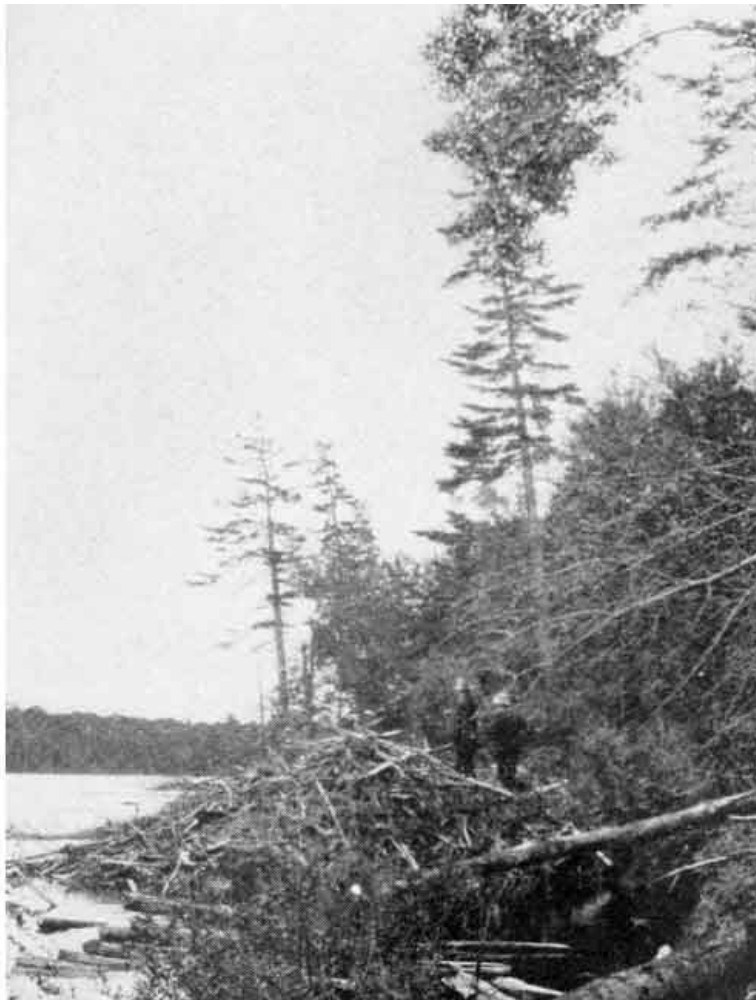
The Beaver House

This beaver house was made of sticks of wood of varying size fastened together by mud. It was cone-shaped and placed on the bank with one edge in the water. It was about fifteen feet in diameter at the base and seven feet high at the center. There were five separate canals or ditches sunk below the bottom of the pond, all entering the house under its base and about four feet below the surface of the water. These allowed the beaver entrance and exit when the ice was very thick in winter.