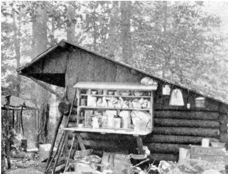
The Cherry Pond Camp

It was early October, and the deer-hunting season had opened on the first day of the month. We had come to hunt deer, but we had no thought of taking a mean advantage of the deer or of violating the game law by hunting him at night along the shores of the pond with a jack light. That would have been too easy, and in our opinion little short of murder. We proposed to be sporty and practice only the "still-hunting" method. That would give the deer long odds and, so to speak, a running chance for his life. Under the prevailing conditions the chances were indeed about twenty to one in his favor.