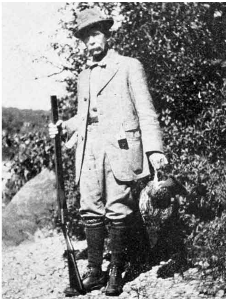
One of the Partridges

This was a show worth the price of admission, and we sat and watched it for fully ten minutes, when a shifting breeze apparently carried our scent to the mother, who instantly sounded a note of warning, and the family party quickly disappeared through the brush into the tall timber, and we paddled back across Cherry Pond to our breakfast of flapjacks, syrup, and onions.