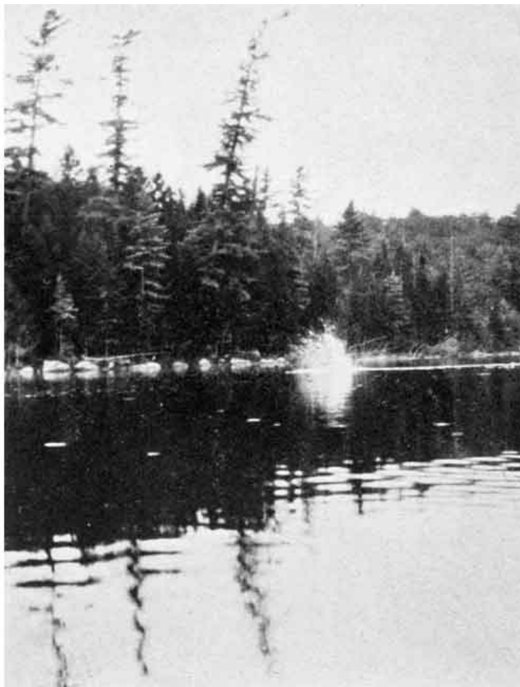
A Beaver Fountain

We were now a half-mile away from the house up the pond and for the first time realized that we were victims of a perfidious beaver trick. His sole purpose was, clearly, to allure us as far away from his house and his family as possible, and he had won.