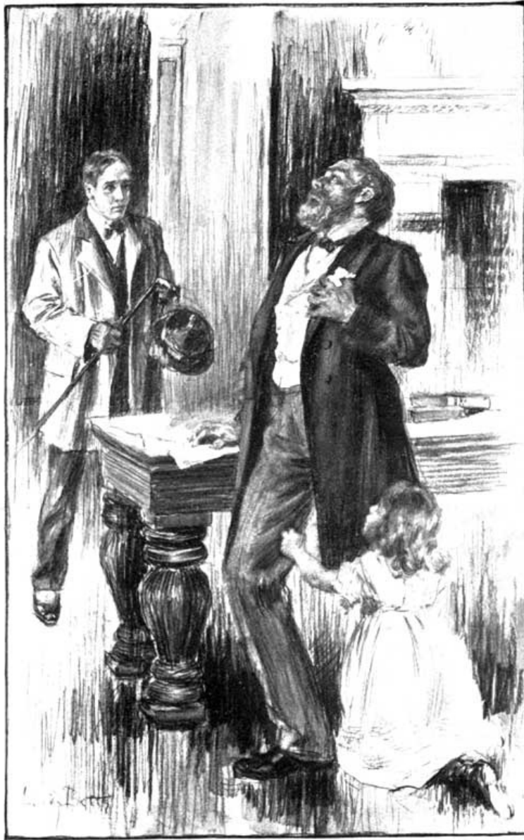
"ONE HAND WAS PRESSED AGAINST HIS HEART"

He cast a meaning glance down at his hand, then seeing that I did not understand him, made a super-human effort and held that member out, uttering some inarticulate words which I was able to construe into a prayer to take from him the paper which his stiffening clutch made it difficult for him to release.