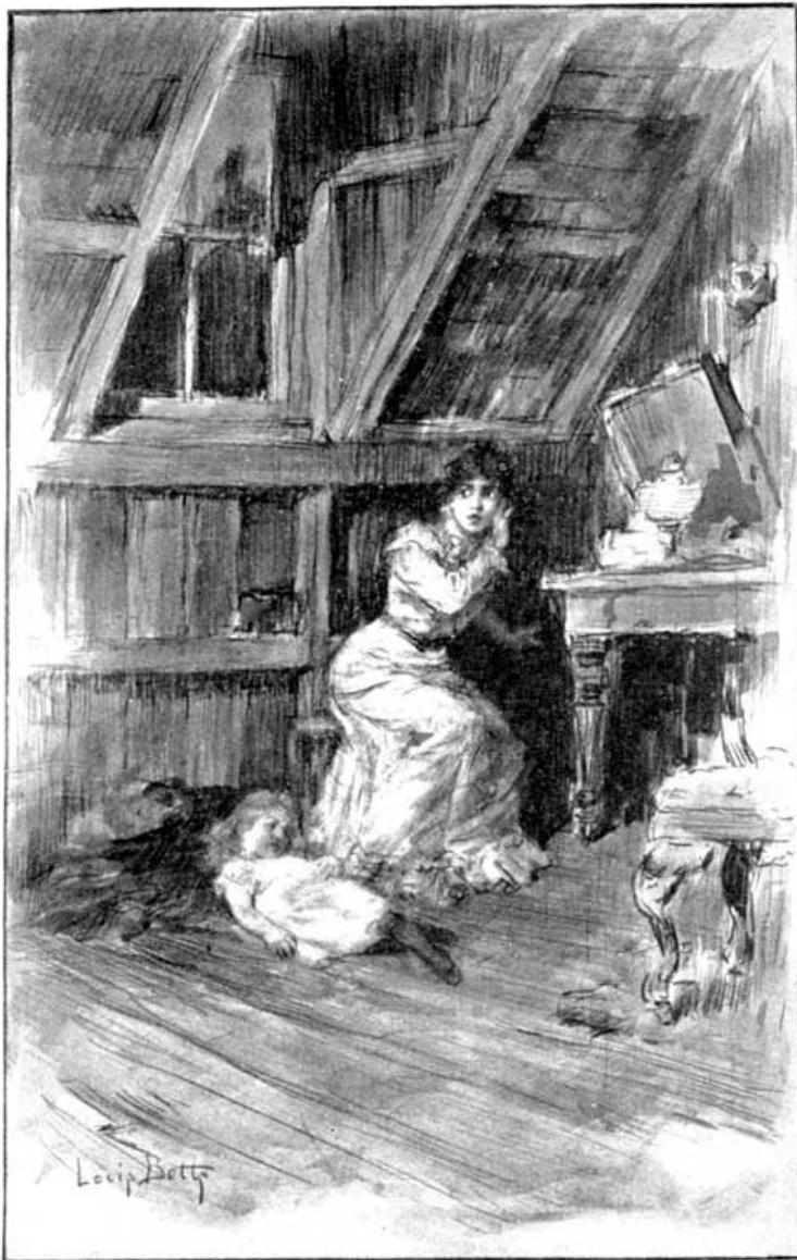
"CROUCHED AGAINST THE FARTHER WALL, WITH WIDE-EXTENDED EYES FIXED FULL UPON US"