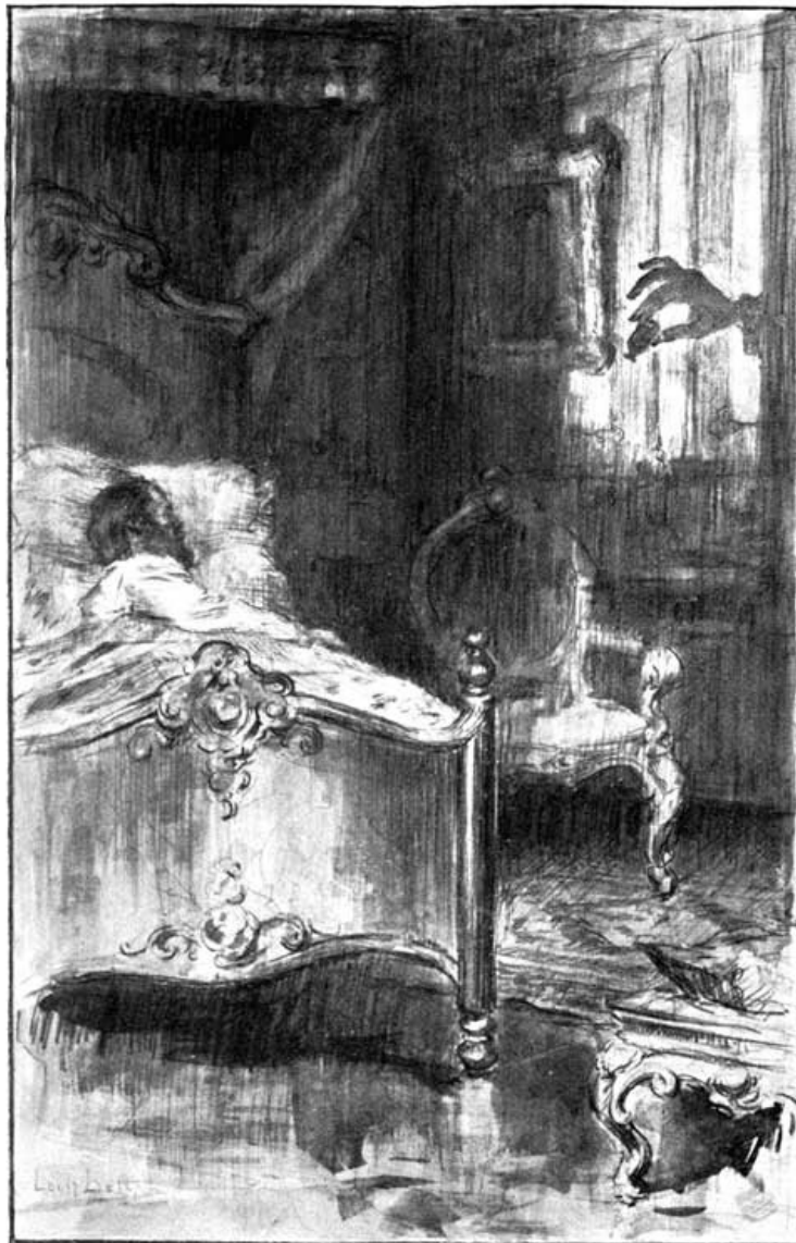
"THAT OF A HAND HOLDING A BOTTLE"

*** START OF THE PROJECT GUTENBERG EBOOK ONE OF MY SONS ***