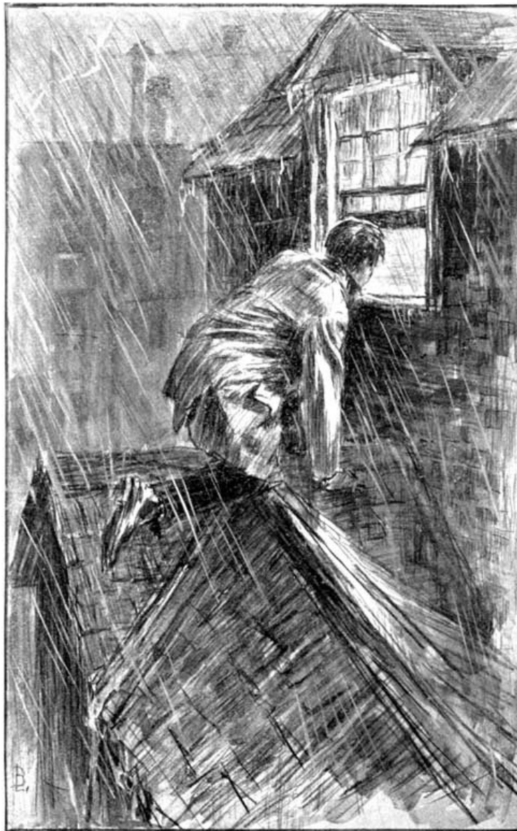
"IN TWO MINUTES I WAS UNDER THAT OPEN WINDOW"

"I shall make a noise; he will hear me——"