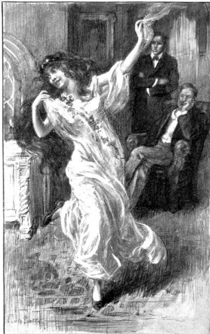
"SHE GLIDED INTO OUR PRESENCE IN ONE RAPTURED WHIRL"

"He was standing in the window of the large but unlovely room, drumming restlessly on the panes before him. As the light struck his head it brought to view the silver rapidly making its way through the dark locks he had been accustomed to pride himself upon, and a pang struck me at this sight, which made me quite dumb for the instant. I felt as if I, and not she, had been dancing