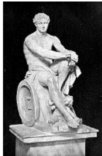
ARES SEATED -- Ludovisi Villa, Rome