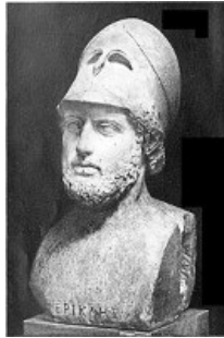
PERICLES -- British Museum, London

Click any photo to view an enlarged version.