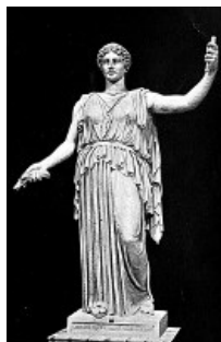
DEMETER (CERES) -- Vatican Gallery, Rome

It comforted her not a little in this time of mourning to take a mother's care of a certain sickly little child she chanced upon. Disguised as a nurse, she fed the child upon ambrosia, held him in her bosom, and at night covered him in a bed of coals. Under this treatment he thrived amazingly; but the parents discovered the nurse's strange ways and became alarmed. Their anxiety was turned to dismay when they learned that this was a goddess, who would have made their son immortal but for their interference.