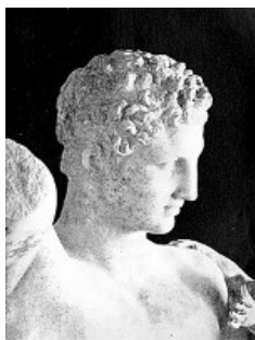
HEAD OF THE OLYMPIAN HERMES -- Museum, Olympia

With this instrument Apollo was so delighted that Hermes straightway presented it to him, to make some amends, as it were, for the injury done him. In return Apollo bestowed the caduceus , or wand, upon Hermes, and the two gods vowed eternal friendship.