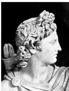
HEAD OF THE APOLLO BELVEDERE -- Vatican Gallery, Rome

The head of Apollo in our illustration is from a famous full-length statue of the god known as the Apollo Belvedere. The name Belvedere, which is useful only to distinguish the statue from others of the same subject, comes from the fact that the marble once adorned a pavilion of the Vatican called the Belvedere.