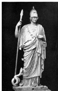
ATHENA GIUSTINIANA (MINERVA MEDICA -- Vatican Gallery, Rome