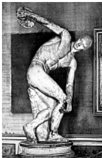
THE DISCOBOLUS (THE DISK- THROWER) -- Lancelotti Palace, Rome