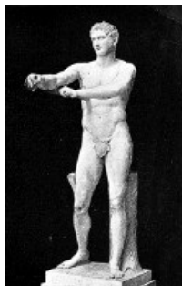
THE APOXYOMENOS -- Vatican Gallery, Rome

There is a passage in the Greek poet Aristophanes' comedy of the Clouds, in which a speaker urges upon a young man the life of the gymnasium. "Fresh and fair in beauty-bloom," he says, "you shall pass your days in the wrestling-ground, or run races beneath the sacred olive trees, crowned with white reed, in company with a pure-hearted friend, smelling of bindweed, and leisure hours, and the white poplar that sheds her leaves, rejoicing in the prime of spring when