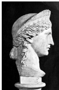
BUST OF HERA (JUNO) -- Ludovisi Villa, Rome

[13] From Kingsley's Greek Heroes: the Argonauts .