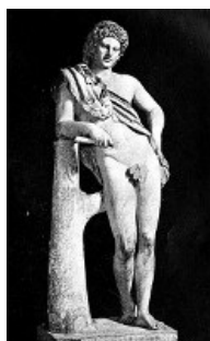
THE FAUN OF PRAXITELES -- Capitol Museum, Rome