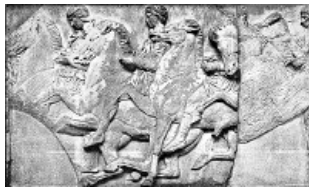
HORSEMEN FROM THE PARTHENON FRIEZE -- British Museum, London -- London Stereoscopic Co., Photo. John Andrew & Son, Sc.