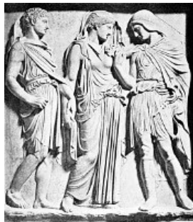
ORPHEUS AND EURYDICE -- Albam Villa, Rome