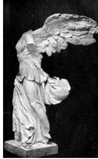
NIKE (THE WINGED VICTORY) -- The Louvre, Paris

The goddess was represented standing on the prow of a vessel as if leading the fleet to success. It may be that the old Greek idea of a goddess at the prow was the origin of the "figure head" for so many years carried by every ship that sailed the seas. The vessels in those old days were called triremes , being propelled by rowers who sat at their oars in three tiers , or banks, which gave the name to the craft. The goddess stood in the middle of what was called the ikrion proras , which would correspond to the fore-castle deck. In her right hand she held a trumpet to her lips, and in her left she carried a crosstree, the framework of a trophy.