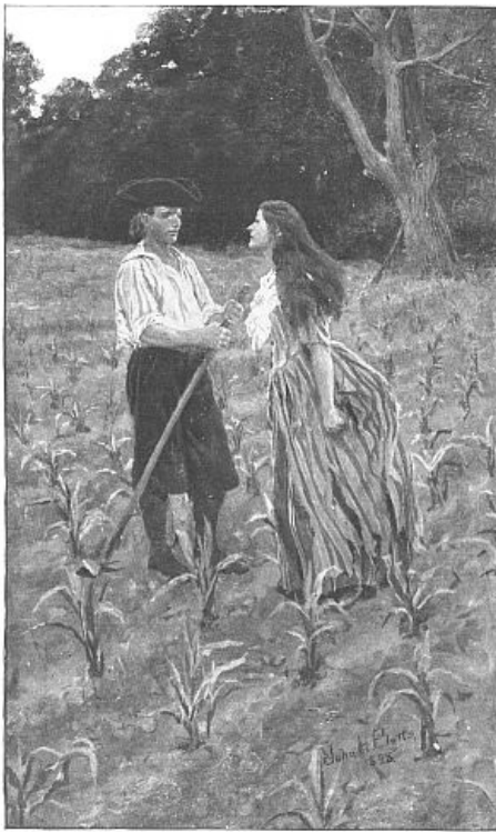
"TOM COWARD, YOU'RE AFRAID!"

before had he heard such an outburst from the gentle and even-tempered Sarah, who had been the leading spirit in Benzeor's household. The children had gone to her with their troubles rather than to their mother, and Sarah had never failed to have a word of comfort or of help for every one. Even Benzeor himself had come to depend upon her judgment in many of his affairs, and she had been as patient and gentle with him as she had been with the troubled little ones.