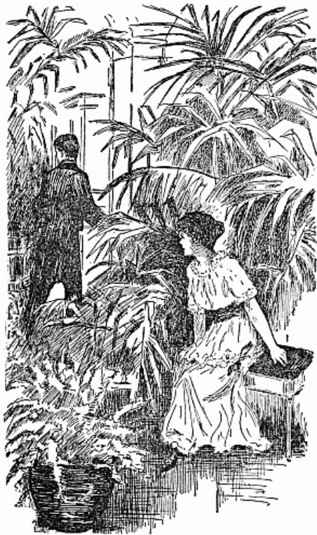
HE GLANCED QUICKLY ABOUT HIM AND THEN DISAPPEARED

Surely in her absorbed interest Angelique had no thought of spying on her friend, for two people could not be seriously confidential when hundreds of others were close about them. Nevertheless the watcher felt her own cheeks flush guiltily as she saw the young man below her whispering something in his companion's ear. The next instant, however, Faith had left the hall with some one else. Then to her intense consternation Angel observed Kenneth Helm coming alone straight up the broad stairs. Could it be possible that either one of them had seen her and that Faith was sending Kenneth to bring her down to the ballroom? With all her heart Angel hoped not. She would like to have gotten up and run away to shelter, yet knew it was impossible for her to move without making a noise. By remaining silent there was just a chance that Kenneth Helm was on his way to the men's dressing room and would not notice her. Moreover, if Faith had not sent him to find her probably he would not even speak to her.