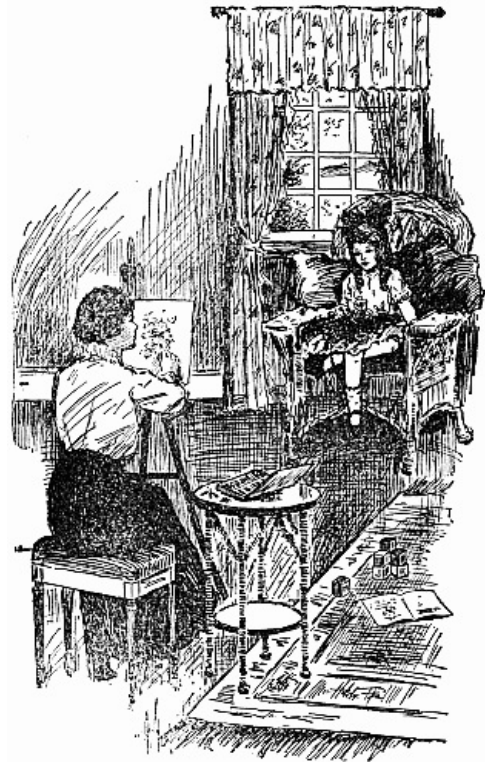
ANGEL HAD CAUGHT BETTINA'S ATTITUDE ALMOST EXACTLY

"I am afraid I won't be here after a while," Betty answered and then walked slowly away. It was absurd for her to feel wounded by such a trifle, and yet recently it had looked as though Bettina preferred Angelique's company to hers. What a useless person she was growing to be! Well, at least she and Meg were going to a Suffrage meeting that afternoon! She had not intended going, but the baby was asleep and Anthony would not be home for hours. Perhaps after the talk ended she might drive by and get Anthony to return with her. She had not thought him looking very well that morning.