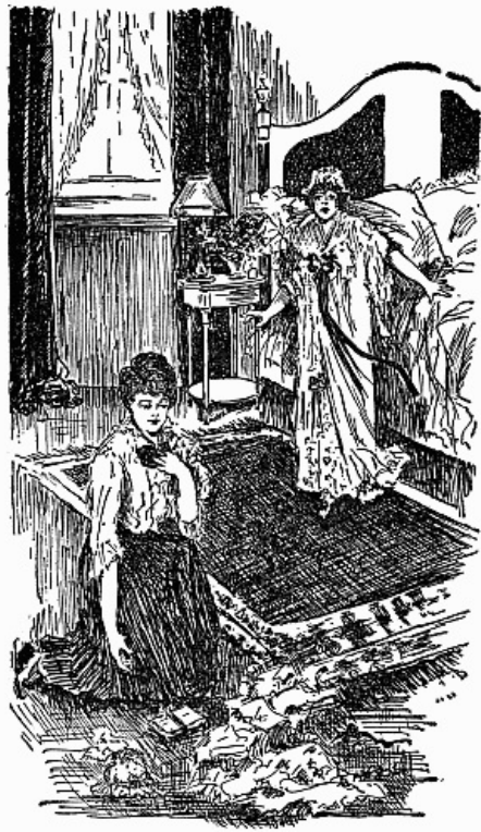
SHE SPRANG OUT OF BED HERSELF THE NEXT MOMENT

Faith tried to jerk the letters from her friend's hand.