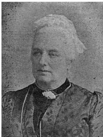
Miss C. M. Yonge.

Adam and Eve. Loyalty George. Dorothy Fox. Robin.