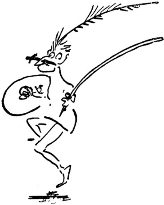
The soul of Mr. Osborn doing a war dance (as a Spartan Red Indian) in order to work itself up for a " Morning Post " article.