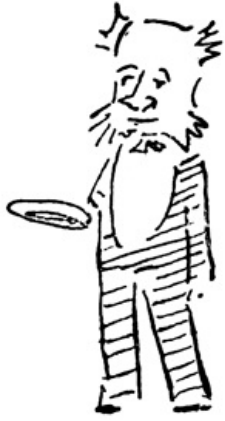
Mutimer at first.

“He gets the house. He has it done up. He furnishes it, and every article of furniture seems a stroke of luck too good to be true. And to crown it all I am going to write one of those long crescendo passages that James loves, a sentence, pages of it, of happy event linking to happy event until at last the incredible completion, a butler, unquestionably Early Georgian, respectability, competence equally unquestionable, a wife who could cook, and cook well, no children, no thought or possibility of children, and to crown all, the perfect name—Mutimer!