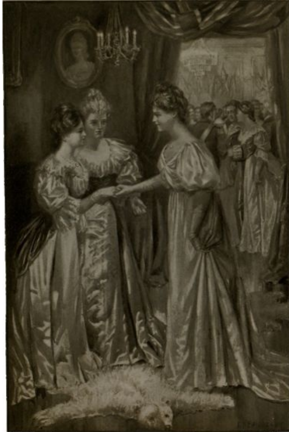
"Strangers and yet not strangers"

She felt strangely attracted by her. Some old memory link of the past was aroused. Had she seen that face before, and if so, when and where? While talking and asking questions Helen's mind was in an analytical mood, dissecting, so far as she could, everything associated with her appearance and life. Who was she? Where had she seen her? Was it possible that their lives had ever touched each other—this woman, double her own age and of different station? Yes, there was a link somewhere. Of this she felt sure. She must solve the mystery, but not now. To find a spot to rest in was enough for the present.