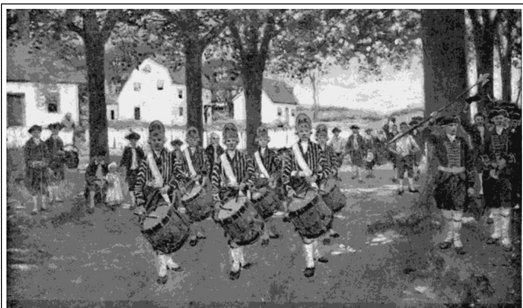
THE DRUMMERS AND FIFERS IN FRONT DID NOT SEE HIM.

In a measure Neil's judgment proved to be correct. Respectable young men, charged to discountenance riotous abuse, began to join the procession at its outset, and this element was continually augmented. As they passed Bradley's shop, Bradley himself stepped out of it and walking at the head of the line, took his place at Harry's right hand. No one interfered. The drummers and fifers in front did not see him, and the stupid Waldeckers, ignorant of English and of everything but the routine of their regiment, took him as a part of the event. He was dressed in black cloth, with a white lawn band around his neck, and if they speculated about him at all, they thought he was a clergyman, and concluded the prisoner was to be hung at the barrier.