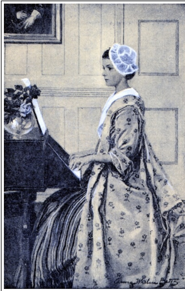
THE SONG OF A SINGLE NOTE.