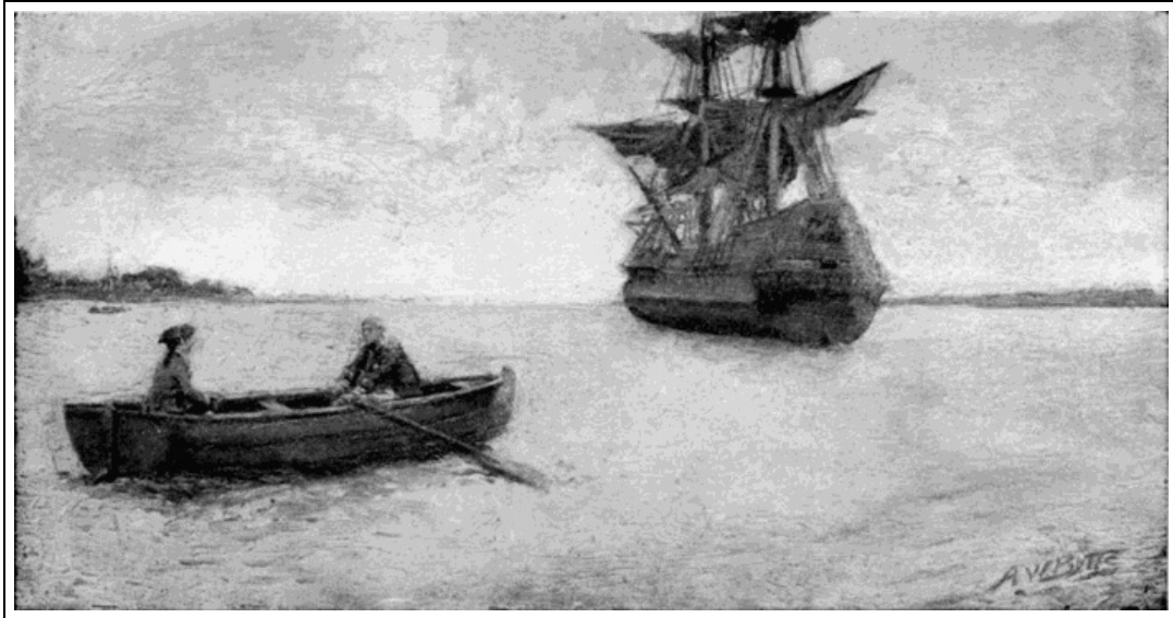
HE CAUSED THE SMALL BOAT TO PUT HIM ON SHORE.

so, he could distinctly hear, and still more distinctly feel the sorrowful tumult of the chaotic, almost frantic town. With swift steps and beating heart he reached the Semple house. He stood still a moment and looked at it. In the morning sunshine it had its usual, peaceful, orderly aspect, and as he reached the gate, he saw the Elder open the door, and, oh, sight of heaven! Maria stepped into the garden with him.