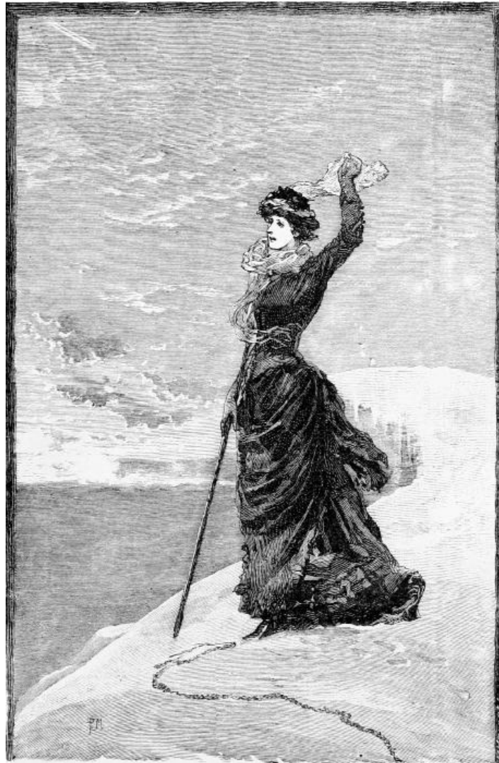
A VISION ON A SUMMIT