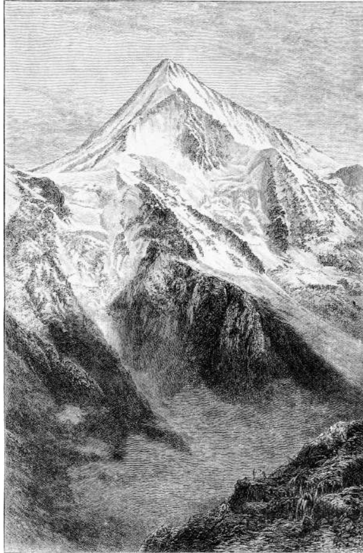
THE BIETSCHHORN. FROM THE PETERSGRAT

LONDON: PRINTED BY SPOTTISWOODE AND CO., NEW-STREET SQUARE AND PARLIAMENT STREET