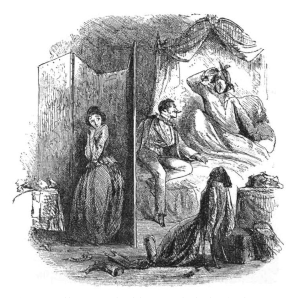
Oh, Kitty! fancy my trembling tenor as I heard that I was in the chamber of Lord George Tiverton. The very utmost I could do was to refrain from a scream; nor do I now know how I succeeded in repressing it.

James came in without any peculiar deference for the sleeper's nerves, and, upsetting a chair or two, stumbled across the room towards the bed, on which he seated himself, calling out "George—Tiverton—old fellow! don't you mean to get up at all to-day?"