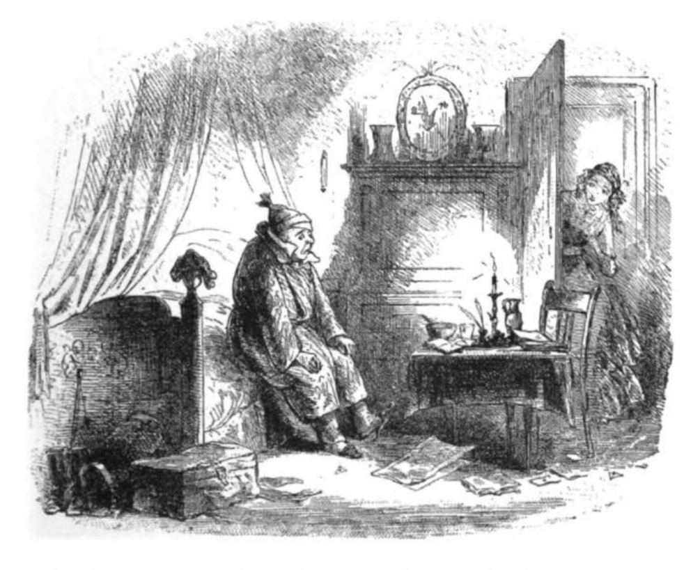
My first thoughts were to affect sleep and not answer, but I saw that there was an eagerness in

"May I come in?" whispered a low but well-known voice,—"may I come in?"