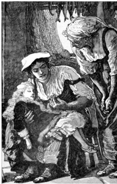
"DOROTHY FELL FAST ASLEEP."