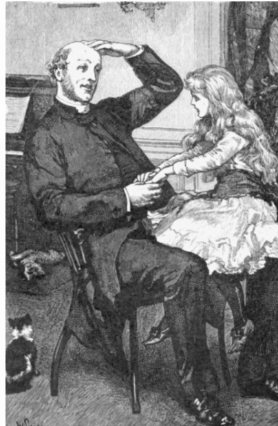
"YOU ARE THE YOUNG CANON"

"Ah!" said the Canon, rubbing his bald head, "there are degrees of comparison, and I am afraid it is old, older, olderer, and oldest, in the cathedral chapter. But I wanted to tell you that at San Remo you will have playfellows—nice little girls and boys, who are living there with their grandmother; and that is what we cannot find for you in Coldchester."