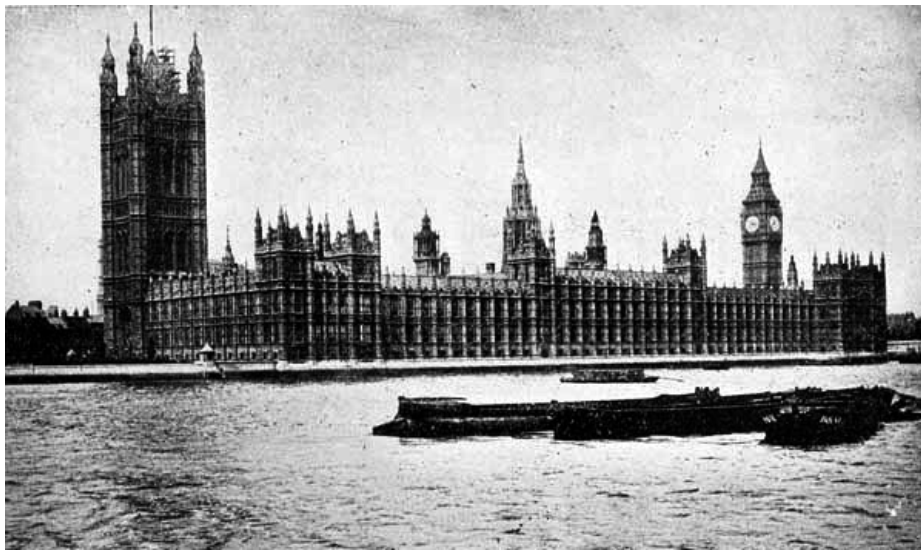
Houses of Parliament.

The Queen wished sincerely not only to do what was best for the people, but also to please them. She could not go to balls and theaters, but early in 1866 she determined to open Parliament in person. The London world rejoiced. They tried to imagine that the old days had come again, and they put on their jewels and their most splendid robes. All the way to the Parliament Building the streets were full of crowds who shouted "Long live the Queen! Hurrah for the Queen!" In the House of Lords there was a most brilliant assembly. Silks rustled and jewels sparkled as all rose to welcome the sovereign. As she entered, the Prince of Wales stepped forward and led her to the throne. The royal Parliamentary robes with all their glitter of gold and glow of crimson were laid upon it, for the Queen wore only mourning hues, a robe of deep purple velvet, trimmed with white miniver. On her head was a Marie Stuart cap of white lace, with a white gauze veil flowing behind. The blue ribbon of the Garter was crossed over her breast, and around her neck was a collar of diamonds. All the radiant look of happiness with which those were familiar who had seen her on the throne before, was gone. She was quiet and self-controlled, but grave and sad. Instead of reading her speech, she gave it to the Lord Chamberlain. At its close, she stepped down from the throne, kissed the Prince of Wales, and walked slowly from the room.