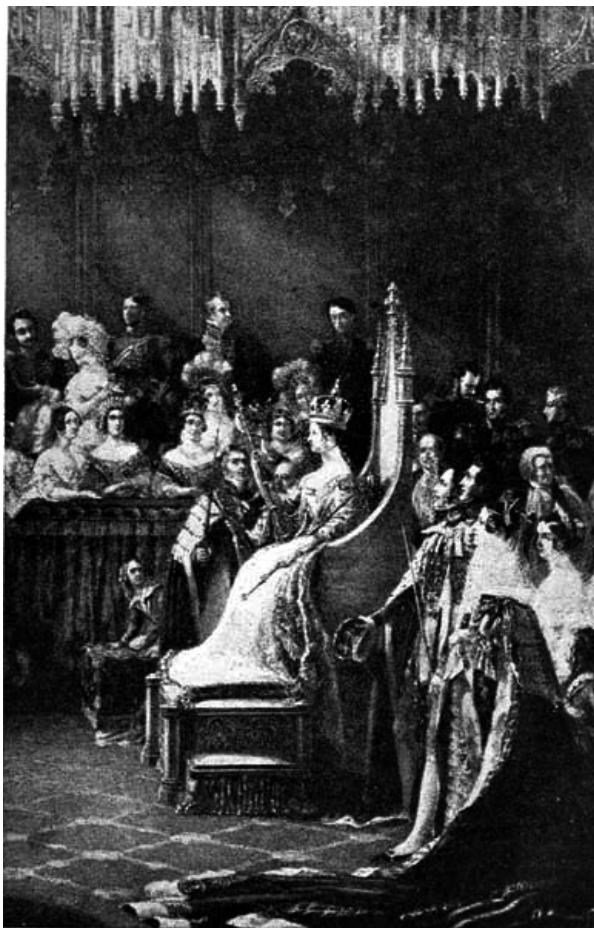
The Coronation of Queen Victoria. (From painting by Sir George Hayter.)

The ceremony of homage followed. The Archbishop, the two royal dukes, and many other dukes, marquises, earls, viscounts, and barons knelt and, kissing her hand, said: "I do become your liege man of life and limb, and of earthly worship, and faith and truth I will bear unto you, to live and die against all manner of folk, so help me God!" One of the peers was so aged and infirm that he tried twice in vain to ascend the steps. The Queen rose and moved toward him and extended her hand to him as simply and naturally as any other young girl might have done who was not sitting on a throne. After the homage, she received the Holy Sacrament; the "Hallelujah Chorus" was sung; and then the procession re-formed and went slowly over the way to Buckingham Palace.