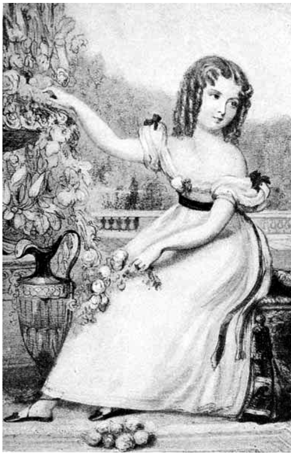
The Princess Victoria at the age of eleven.

It must have given the little girl of eleven years a strange feeling to read a chart of sovereigns of her country and know that her own name would be written in the next vacant place. She had seen the deference paid to "Uncle King," she knew that his will was law, and it must have made the child's brain whirl to think "Some day I shall be in his place." She had always been trained to the most strict obedience, but she knew that some day whatever order she chose to give would be obeyed. She seems to have thought more of the responsibility of the throne than of its glories; but if she had felt ever so much inclined to boast, she would soon have realized that after all she was only a little girl who must obey rather than command, for the first consequence of her queenly prospects was an examination in her lessons before two learned bishops.