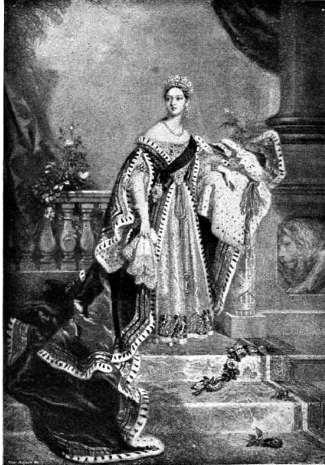
Her Majesty the Queen in her state robes. (From painting by Alfred F. Chalon, R.A., 1838.)