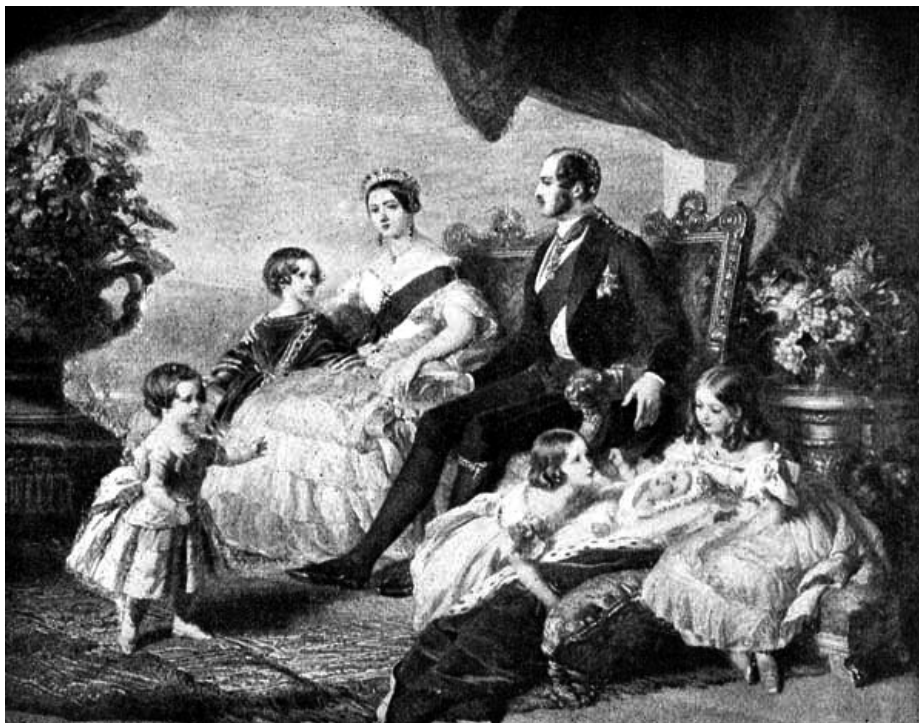
Queen Victoria; Prince Albert; Victoria, Princess Royal; Albert Edward, Prince of Wales; Prince Alfred; Princess Alice; Princess Helena. (From painting by F. Winterhalter, 1848.)

Besides the calls of home and state, many other responsibilities fell upon the sovereign of England. In the latter part of 1851, trade was very dull in London, and the Queen decided to give a great fancy ball at Buckingham Palace so that sales might be increased. All the guests were asked to come in the costume of the time of the Stuarts, and this was so gay and picturesque that the ballroom must have been a most brilliant sight. The Queen wore a gray dress , but it was hardly as simple as one would expect from those two words, for it was glittering with gold and silver lace, while clusters of diamonds flashed forth from bows of rose-colored ribbon. The front of the dress opened to display a cloth-of-gold stomacher and underskirt made gorgeous with large emeralds. Strings of pearls were braided in with her hair, and upon her head she wore a small crown of diamonds and emeralds. Her gloves and shoes were heavily embroidered with gold. The costume of the Prince was a veritable rainbow, for he was all aglow in an orange coat, with its sleeves turned up with crimson velvet, breeches of crimson velvet, and stockings of lavender silk. This was not all by any means, for there were pink epaulets, pink satin bows, gold lace, a silver baldric, and a hat with long white ostrich feathers.