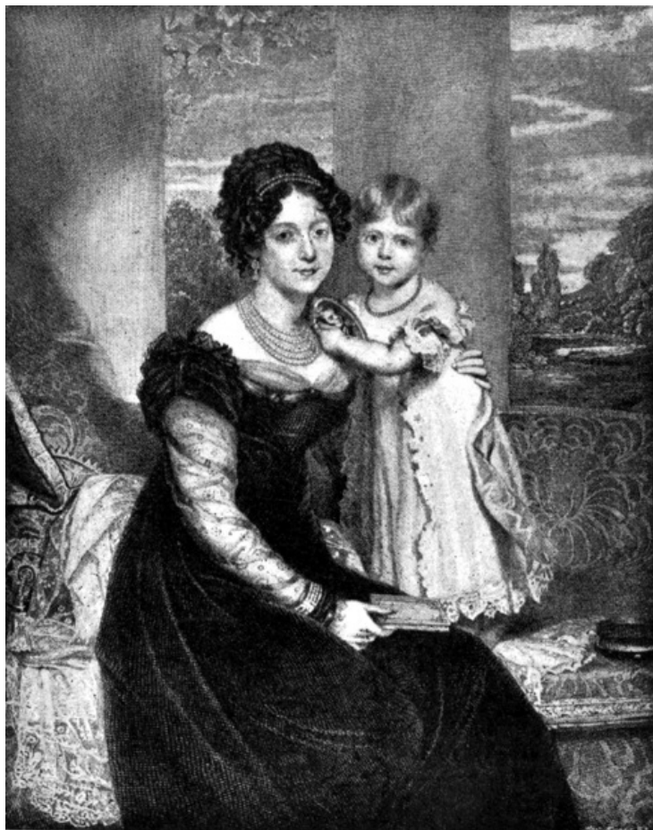
Her Royal Highness the Duchess of Kent and Princess Victoria. (From painting by Sir W. Beechey, R.A.)

If this story had been a fairy tale, the fairy godmother with the magic wand would have been called upon to shower golden guineas into the empty purse, but in this case it was the good uncle who came to the aid of his Princess niece. When Prince Leopold married the Princess Charlotte he went to England to live, for he expected that some day his wife would become Queen of Great Britain. After her death he made his home in England, but spent much of his time in travelling. He was not rich, but he was glad to help his sister as much as possible, and after the death of the Duke of Kent he made her and her children his first care.