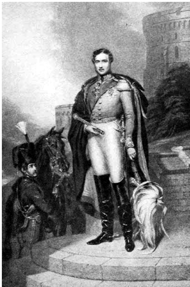
Albert, Prince Consort, in the uniform of a field marshal.

At the moment the ring was placed on the Queen's finger, the guns in the Park and at the Tower were fired, and the bells rang out their merriest peals. When the ceremony was over, the party returned to Buckingham Palace for a wedding breakfast. The bridesmaid who wrote the account of the wedding said that Prince Albert "seemed a little nervous about getting into the carriage with a lady with a tail six yards long," but they all reached the palace in safety. After the breakfast the sunshine at last beamed down upon them, and the young couple sped away for their honeymoon at Windsor Castle.