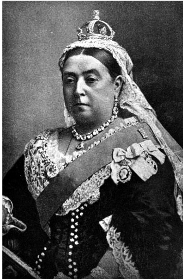
Her Majesty, Queen Victoria.

from the English colonies, but from almost all the countries of the world. They were full of congratulations on the length of her reign; for now she had been on the throne longer than any other English ruler, and longer than any one who had ever ruled on the Continent except Louis XIV. No European monarch who had been on the throne at her accession or even ten years after her accession was still reigning. She had seen change of government, assassination, revolution, in other kingdoms, but the monarchy in England had stood firm and was much stronger than when she became Queen.