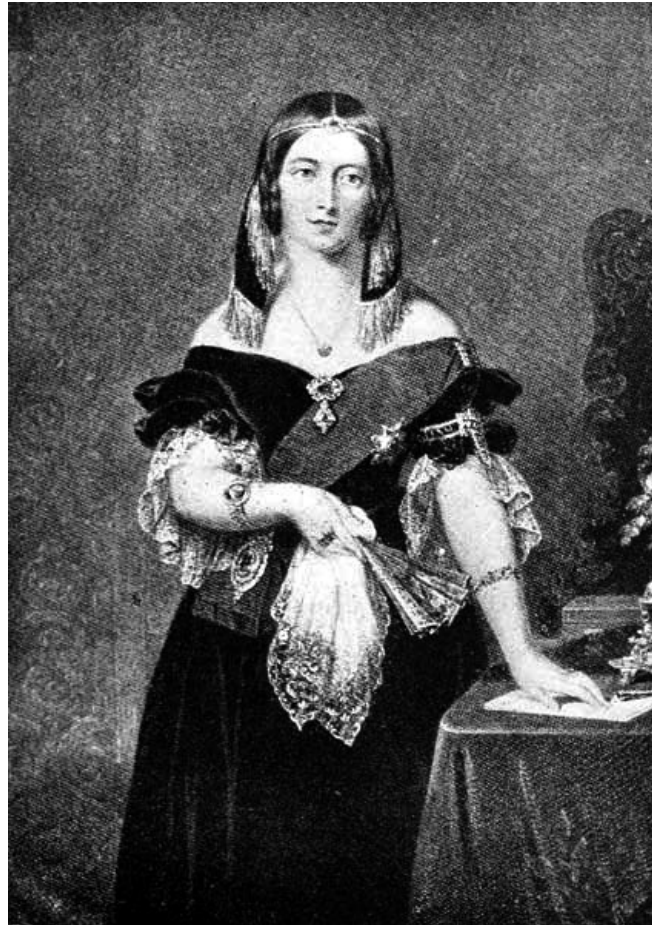
The Queen in 1845. (From a painting by John Partridge.)

torches were brought on the lawn in front of the house, and by their wild and flaring light the Highlanders danced the gayest, merriest reels that can be imagined. The visitors spent several days in this charming place. A ball was given for them, but the Queen seems to have enjoyed much more heartily the quiet drives that she took about the country, the row up the lake, with two pipers sitting in the bow of the boat, piping and singing weird Gaelic boat songs; and perhaps most of all, the little picnics they had and the walks that they took, for there was no one to stare at them, and they roamed about in perfect freedom, guarded only by two Highlanders who, according to the ancient custom, followed them with drawn swords wherever they went.