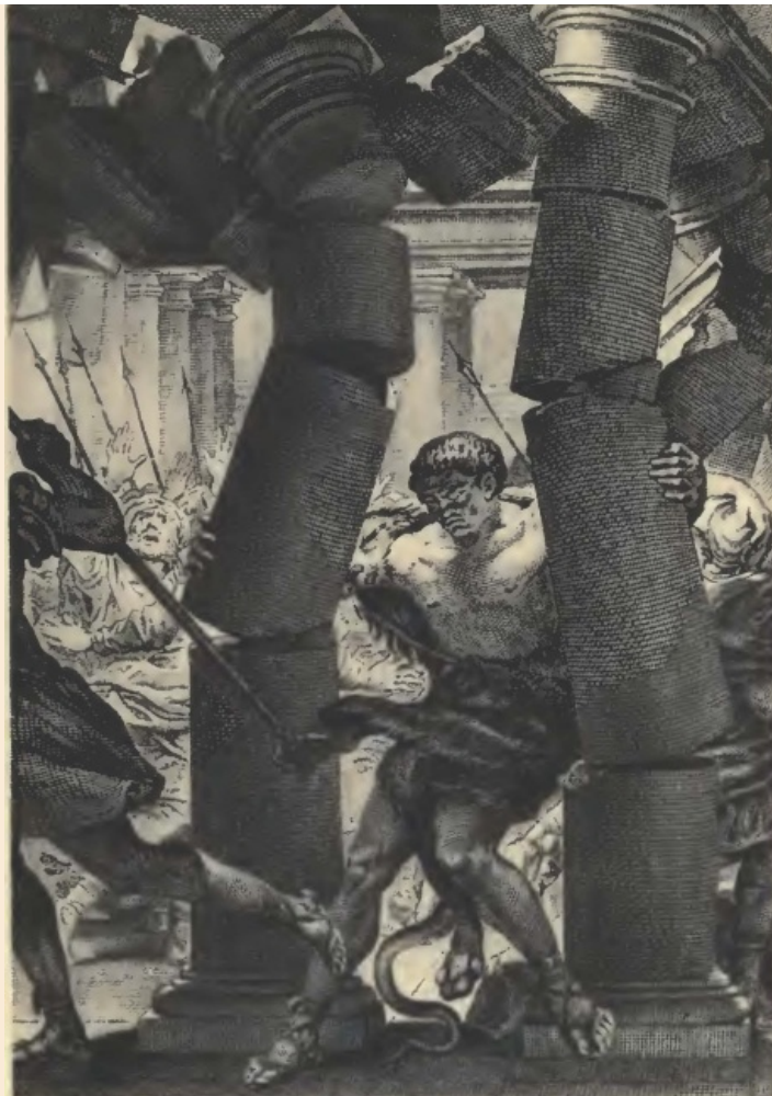
Samson destroying the Temple.