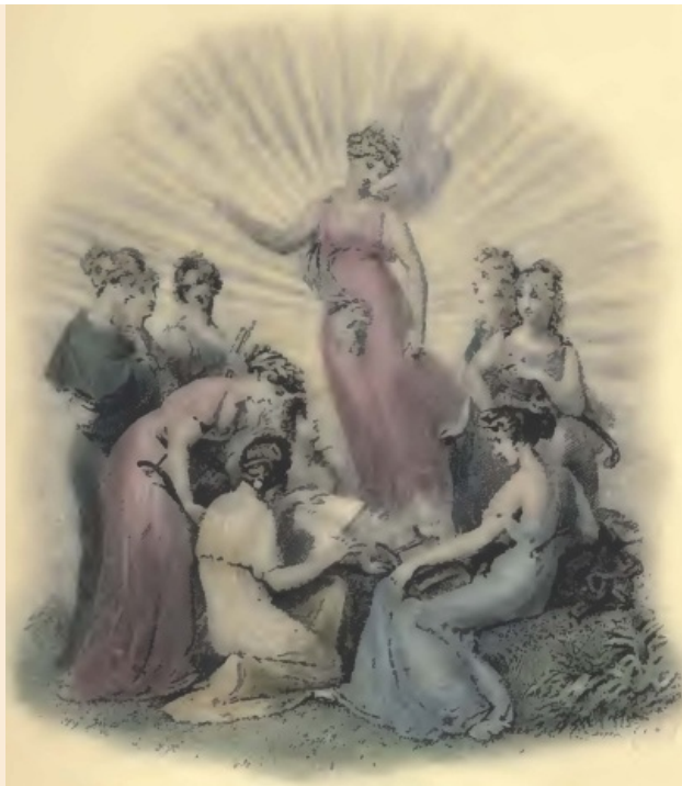
Genius inspiring the muses.

"Here," said the spirit, "are twelve millions of Americans slain in their own country for not having been baptized." "Ah! My God! why were not these frightful skeletons left to whiten in the hemisphere where the bodies were born, and where they were murdered in so many various ways? Why are all these abominable monuments of barbarity and fanaticism assembled here?" "For thy instruction."