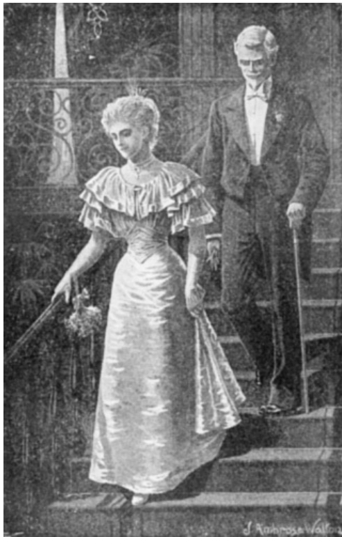
“The girl’s face shone like a piece of delicate statuary” (page 37 ). [Frontispiece.]