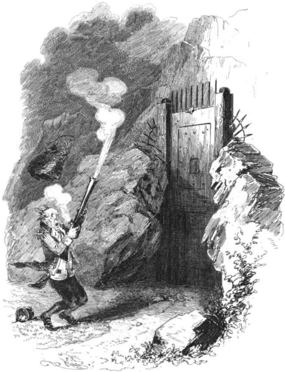
Forester's warm reception at the "Corvy".