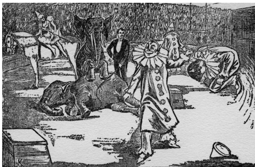
LEO'S FIRST APPEARANCE

*** START OF THE PROJECT GUTENBERG EBOOK LEO THE CIRCUS BOY; OR, LIFE UNDER THE GREAT WHITE CANVAS ***